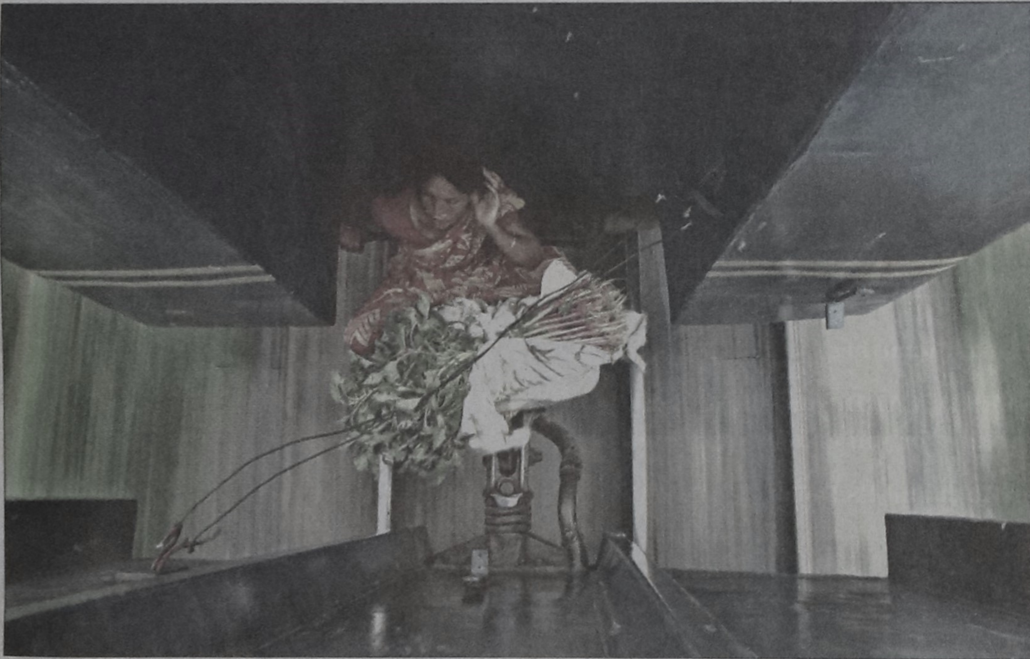
FREE RIDE... This vegetable vendor brings goods from Mymensingh to Karwan Bazar in Dhaka for sale. The risky ride between two bogies of a train is a must to keep her tiny profit margin.