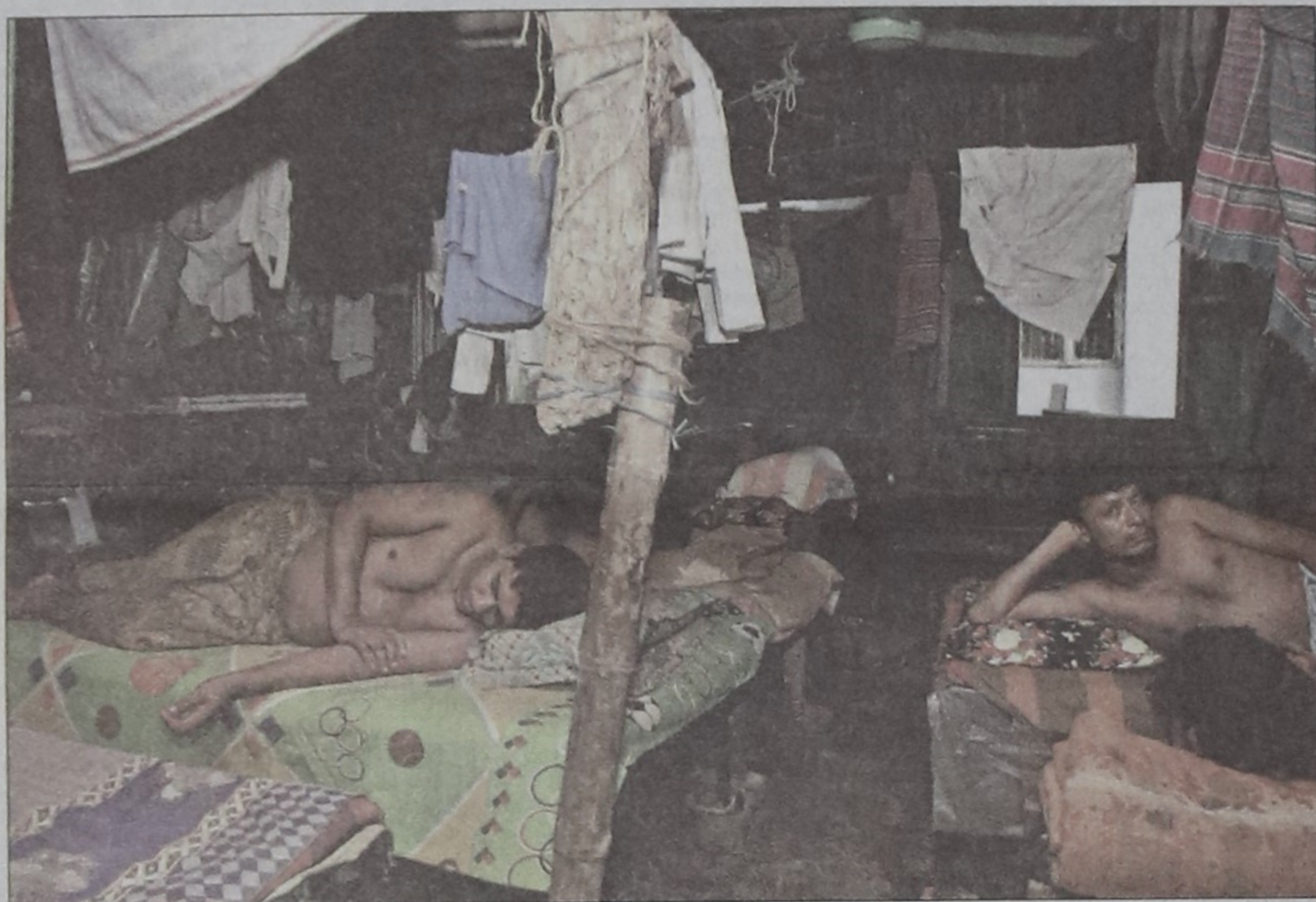
This damp and dingy room at Detective Branch headquarters in Dhaka is home to around 100 policemen although it was designed for only 30. Cops sleep in turns depending on their duty times. The messy camp has only three toilets, one of which is unusable, and no bathrooms.