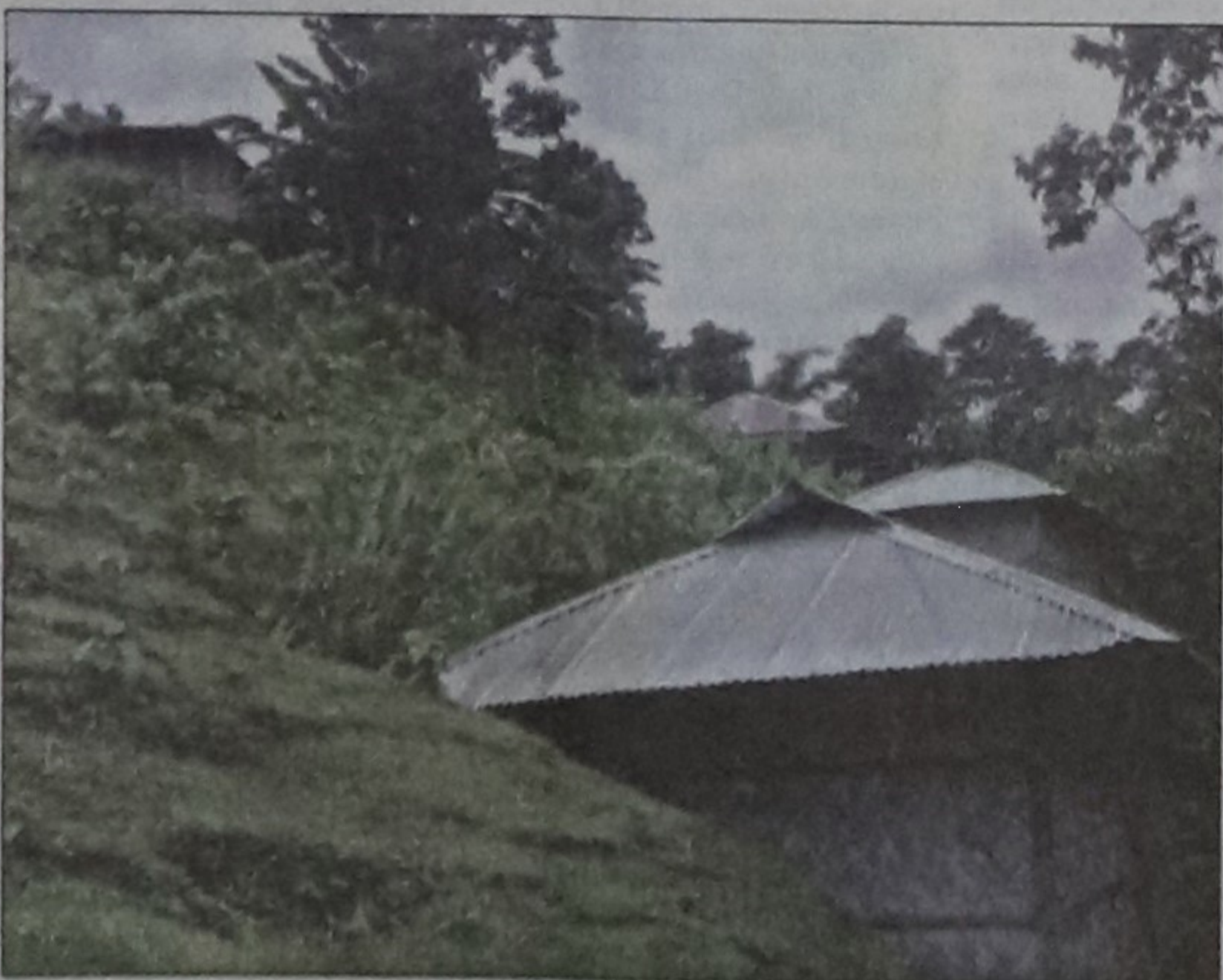
People of Zia Nagar cluster village in Khagrachhari built their homes cutting a hill ignoring what a landslide could do to their lives. No steps have yet been taken to relocate them.