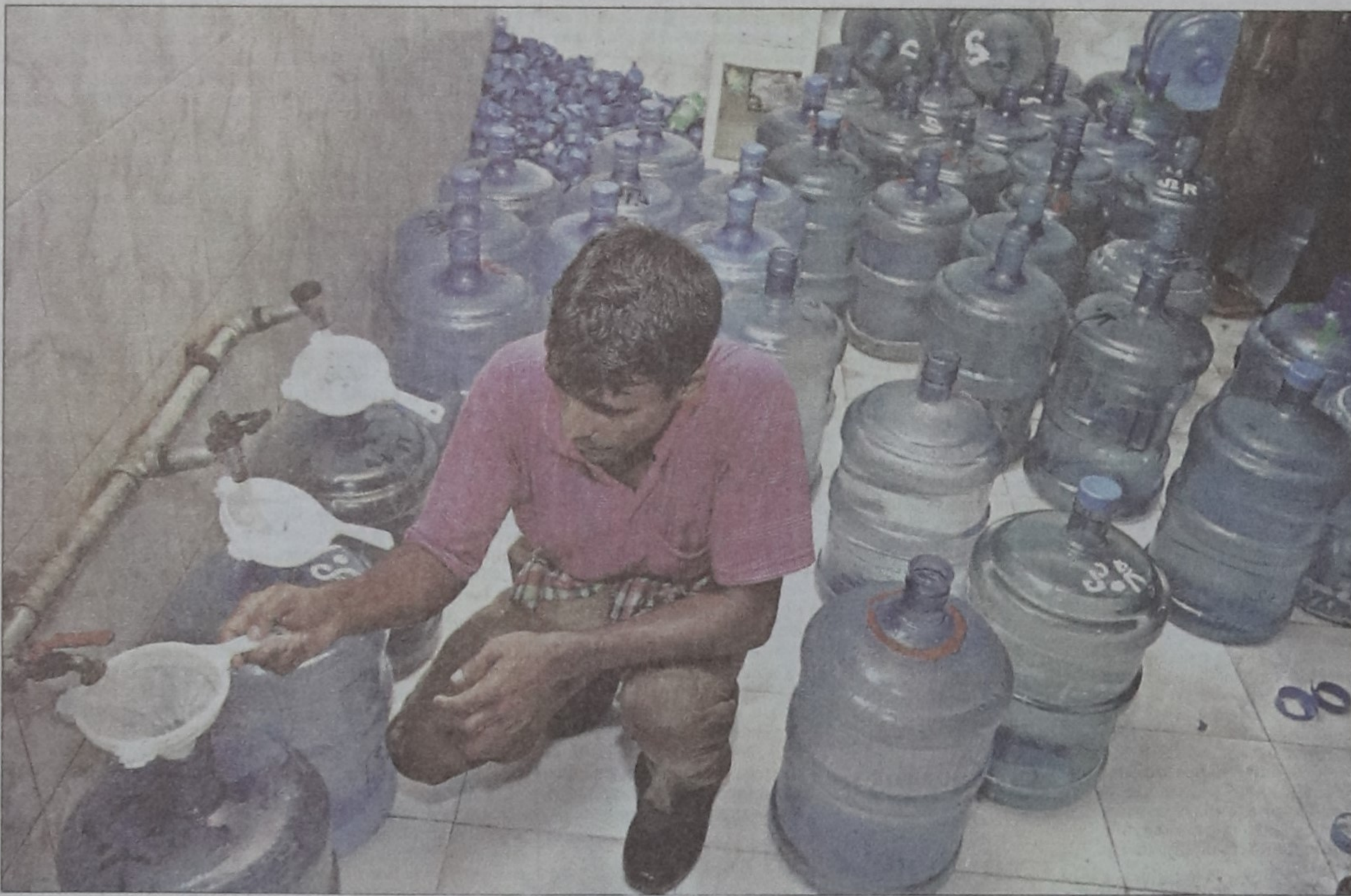
A worker of a fake mineral water plant fills five-gallon containers with supply water at Karwan Bazar. BSTI officials with the help of Rab personnel caught him in the act and made the arrest yesterday.