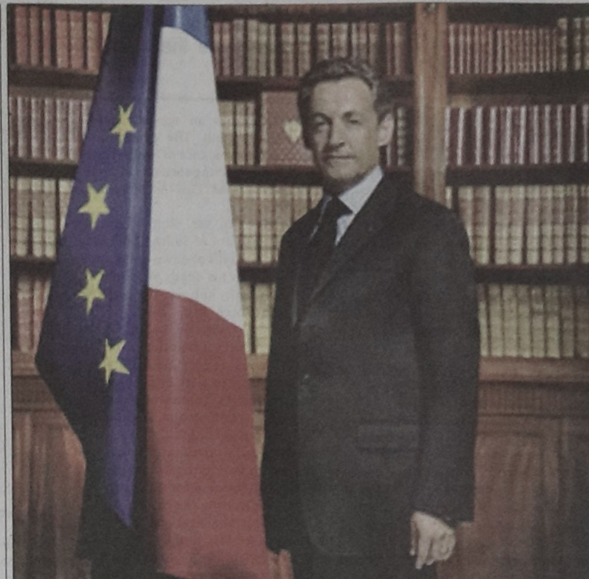
Nicolas Sarkozy, President of France