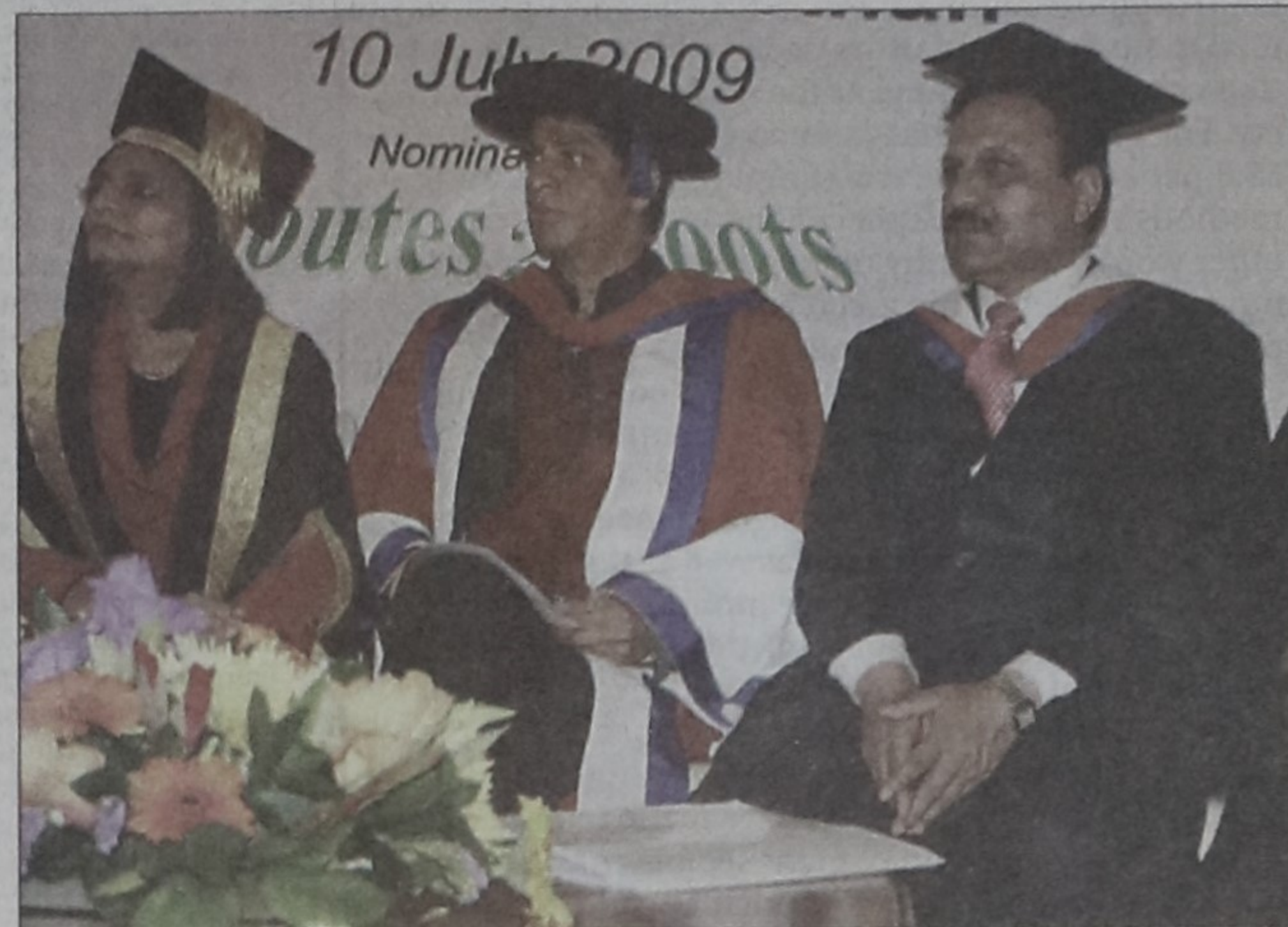
Shah Rukh Khan (centre) is now a Doctor of Arts.