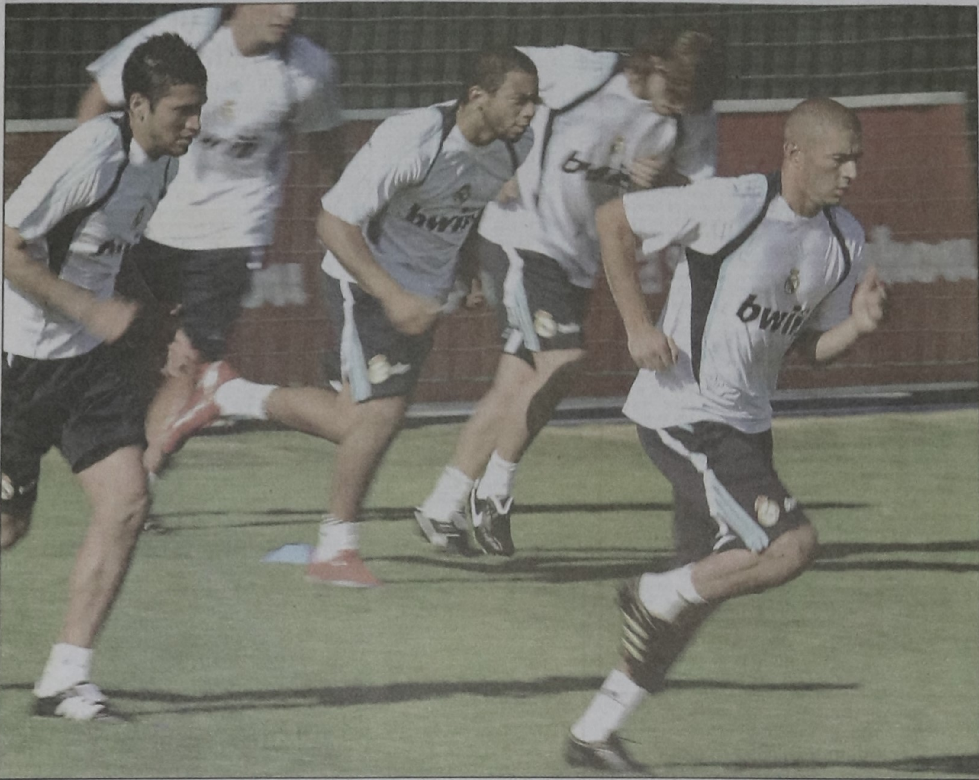
Real Madrid's French striker Karim Benzema (R) runs with teammates during a training session at the Valdebebas training camp in Madrid on Saturday.