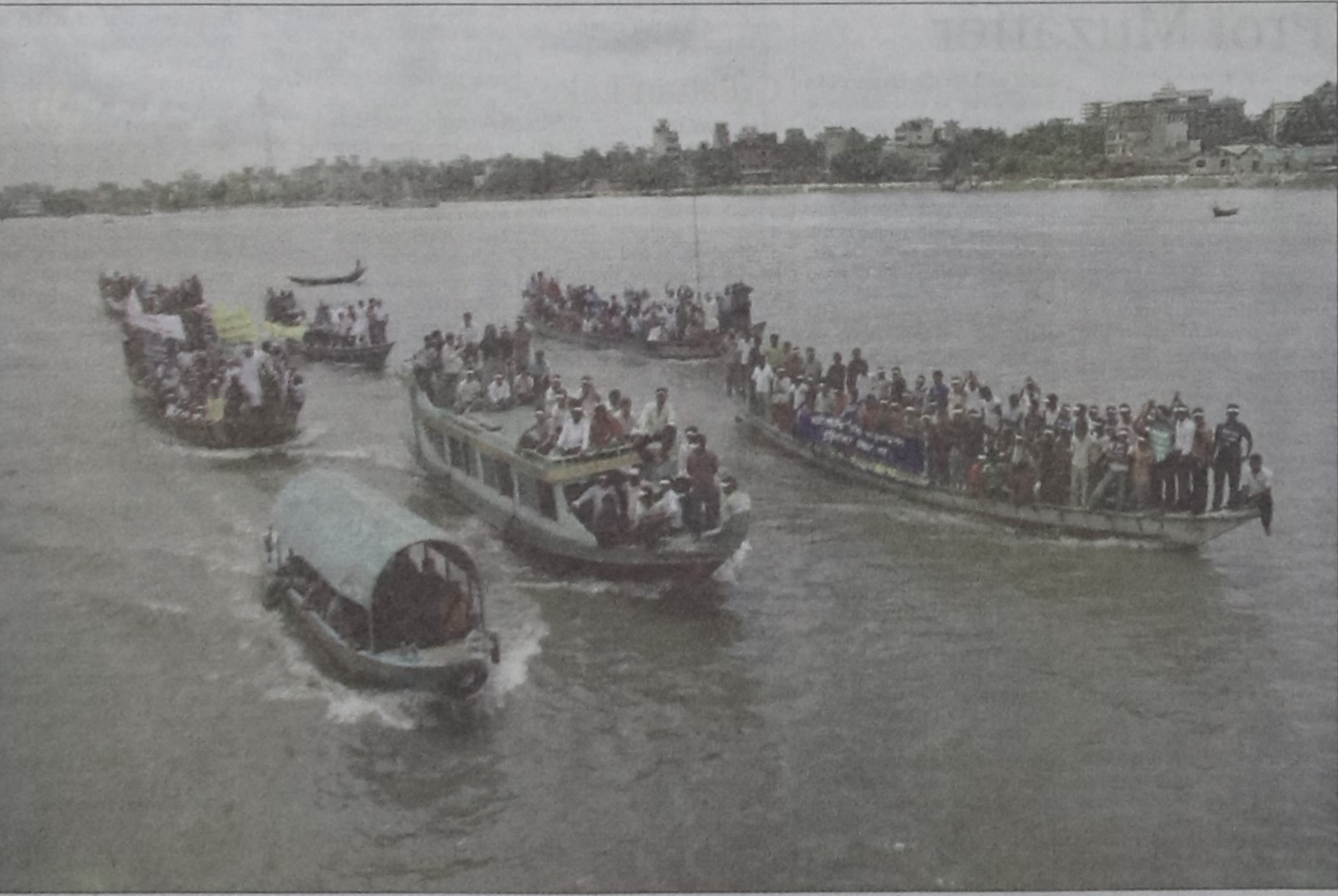
Environment groups Bapa and Dhaka Nagorik hold a rally on boats yesterday morning demanding the Buriganga be saved from encroachers and pollution. The photo was taken at Swari Ghat.