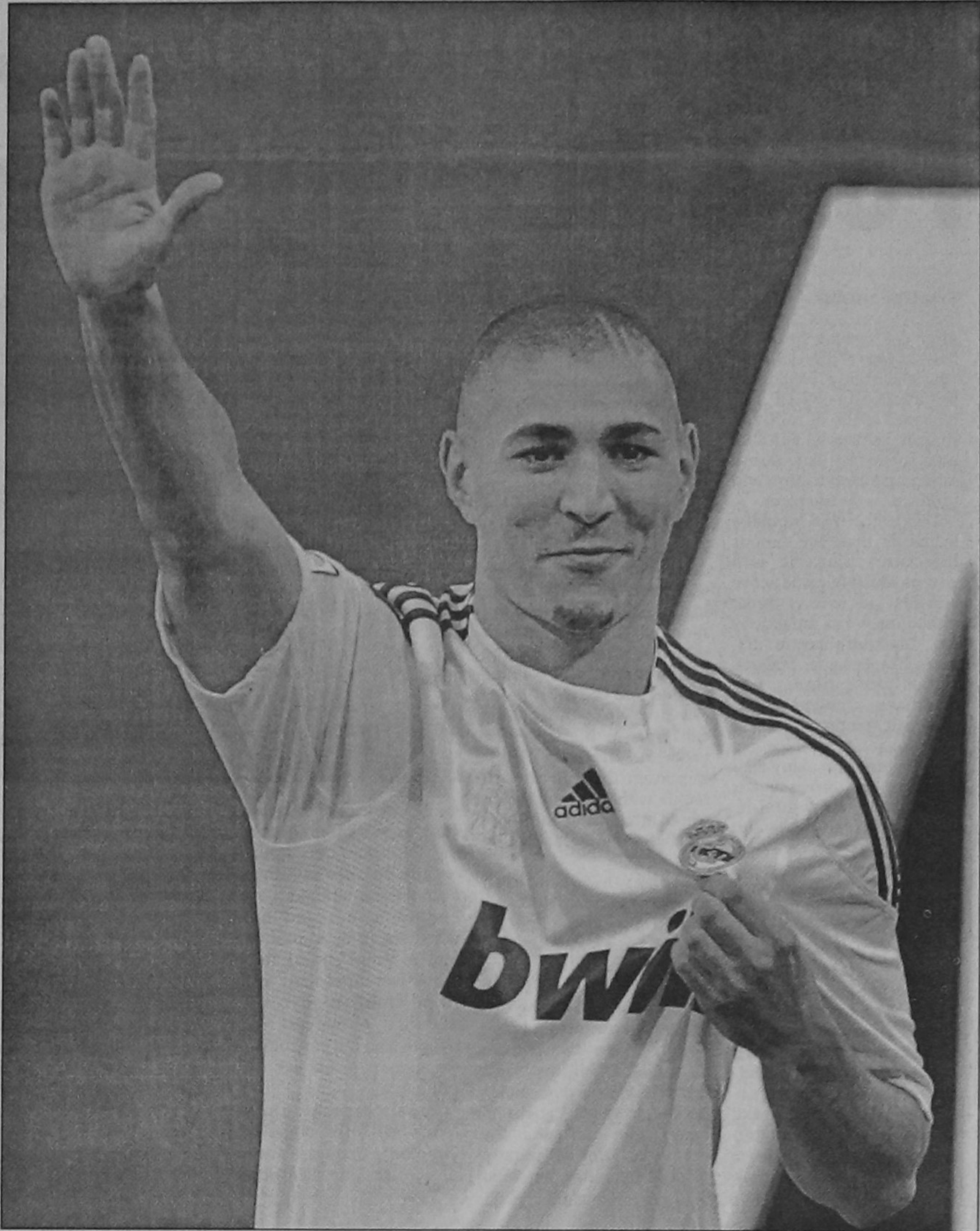
Real Madrid's new player French striker Karim Benzema waves during his official presentation at the Santiago Bernabeu on Thursday.

France striker Karim Benzema passed a medical and signed a six-year contract with Real Madrid on Thursday, before being presented in front of about 20,000 fans at the Bernabeu. "I am delighted to be able to play in the club where my idols Zinedine Zidane and Ronaldo played. Thank you (Real president) Florentino Perez," the 21-year-old said. Benzema, the Primera Liga club's fourth high profile signing of the close season, has moved from Olympique Lyon for a fee that could rise to 41 million euros ($57.07 million). Benzema said Brazilian World Cup winner Ronaldo will be his inspiration as he looks to fire the goals to help the Spanish giants dethrone Barcelona in La Liga. "Ronaldo is the greatest player in the world. He is my inspiration and every time I go on the pitch I will try to repeat what he did," said the 21-year-old French striker in tribute to the club's former star attacker. However, Benzema, bought from French side Lyon, refused to put a number on the goals he'll score in his first season with big-spending Real. "I am at a club at the highest level, the competition at Real will be very tough and I will have to work to make my mark," added Benzema who will be paid an estimated 6.5 million euros a year. Benzema, who was also a target for Manchester United, Barcelona and Inter Milan, added: "Real are a very big team. It's a dream to play here." The Frenchman will play in a Real Madrid side which will also feature fellow newboys Kaka and Cristiano Ronaldo.