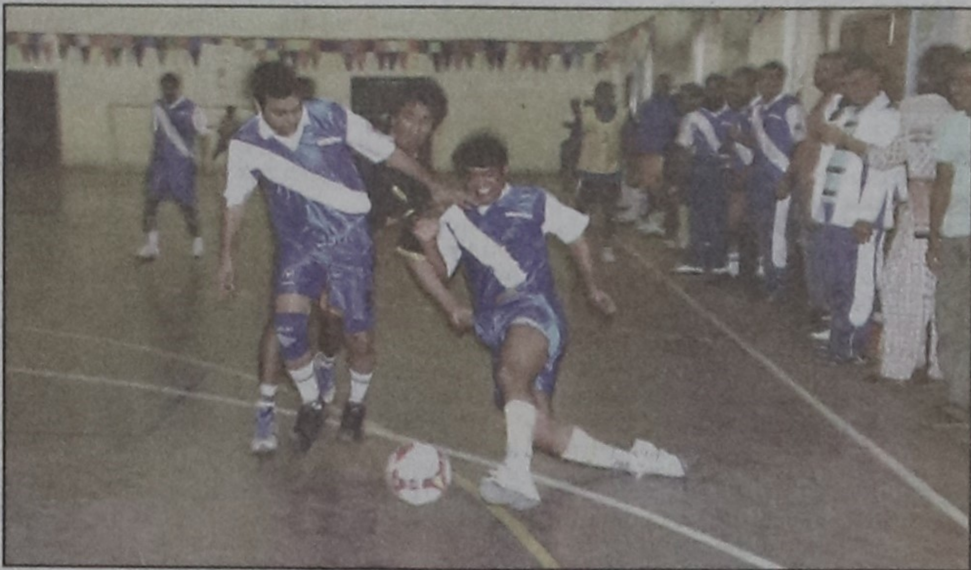
Action from the Ascent Group Corporate 5-a-side indoor soccer cup at the Scholastica STM Hall premises in Uttara yesterday.

Younus indicated the final composition will not be decided until Sunday morning after a good look at the wicket and weather conditions. Thundershowers are forecast during the match.