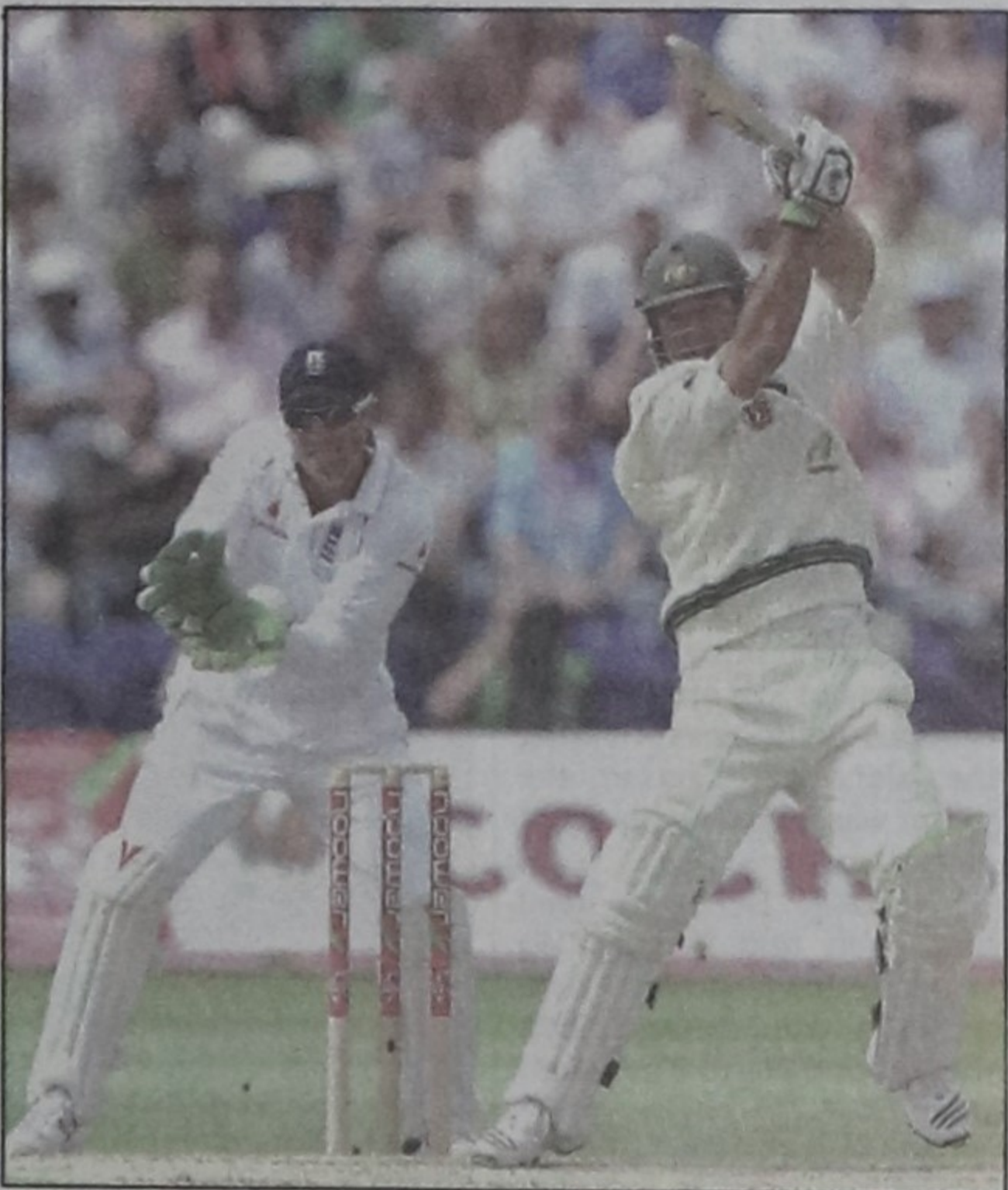
Australia skipper Ricky Ponting (R) drives off the back-foot during his knock of 150 against England on the third day of the first Ashes Test in Cardiff yesterday.