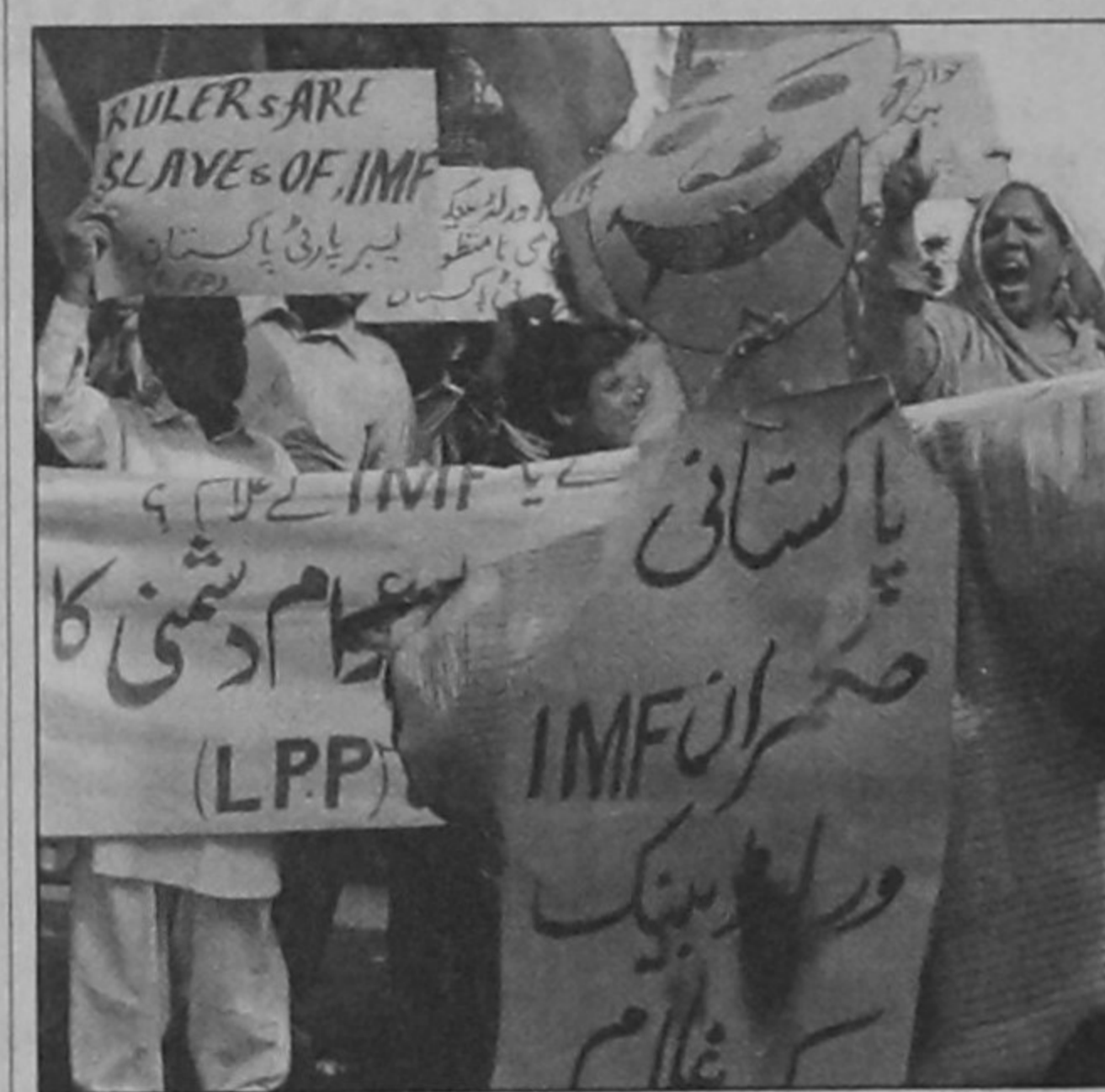
Activists of the Labour Party, a Pakistani left wing group, burn an effigy representing the International Monetary Fund (IMF) as they protest the increase in petroleum prices in Karachi on Thursday. Pakistan's Supreme Court had intervened into a parliament's decision and ordered to remove newly imposed carbon dioxide tax, which made the oil prices up to 21 percent cheaper.

The area is also home to crucial water sources, a profitable Israeli winery, and Israeli settlements with about 18,000 residents. About 17,000 Druse Arabs loyal to Syria also live there.