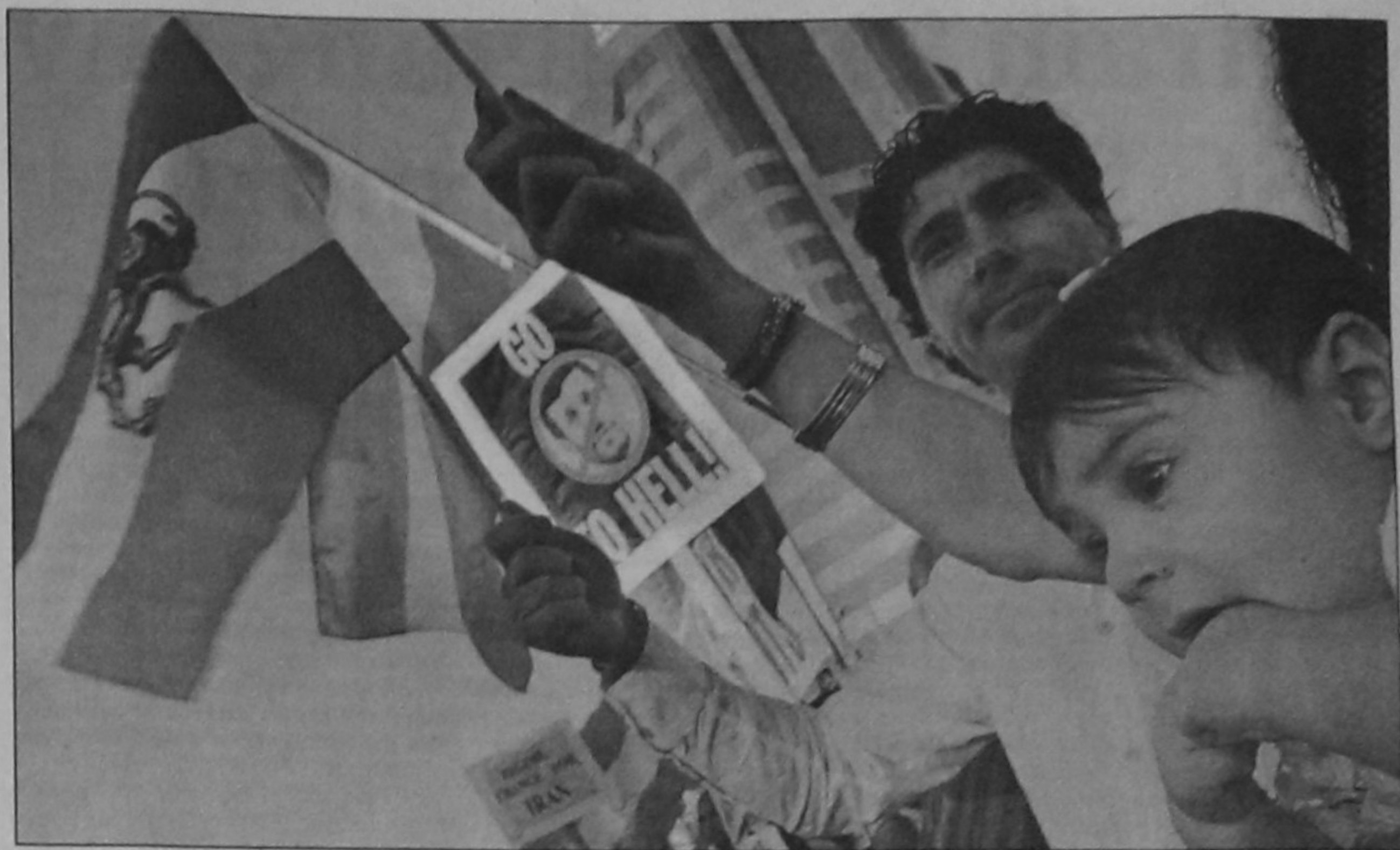
Iranian demonstrators hold up flags and placards during a protest against the recent Iranian elections, outside the Federal Building in Los Angeles on Thursday. An Iranian crackdown on all dissent since the re-election of hardline President Mahmoud Ahmadinejad in a disputed vote four weeks ago has failed to keep supporters of his defeated challenger off the streets of Tehran.

"I think this is an important lesson to the world that we have got to construct a bargain or a deal or a compact between non-nuclear states and nuclear states."