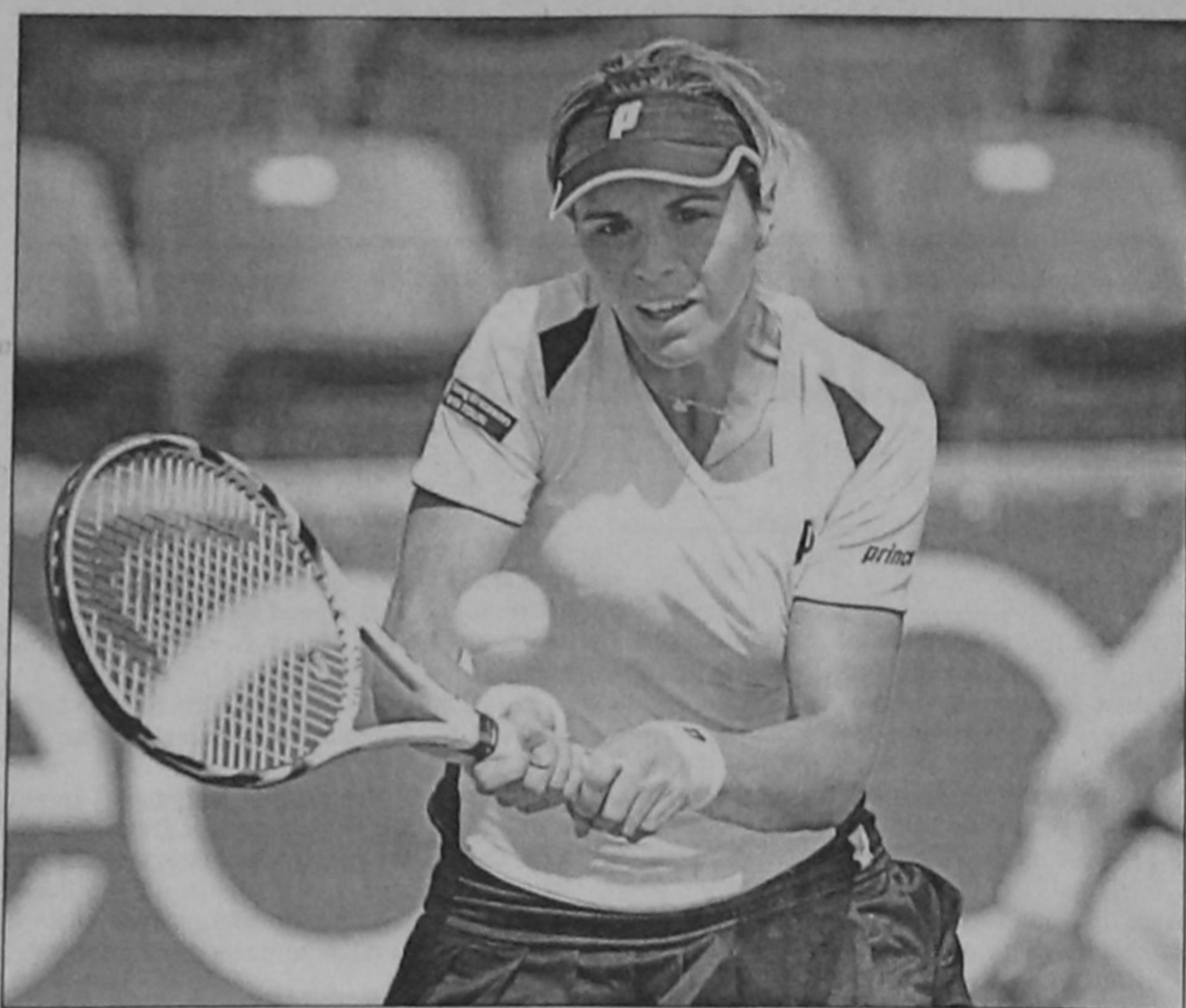
Maria Jose Martinez Sanchez of Spain plays forehand to compatriot Carla Suarez Navarro during their Swedish Open quarterfinal in Baastad yesterday. Sanchez won 4-6, 6-3, 6-0.