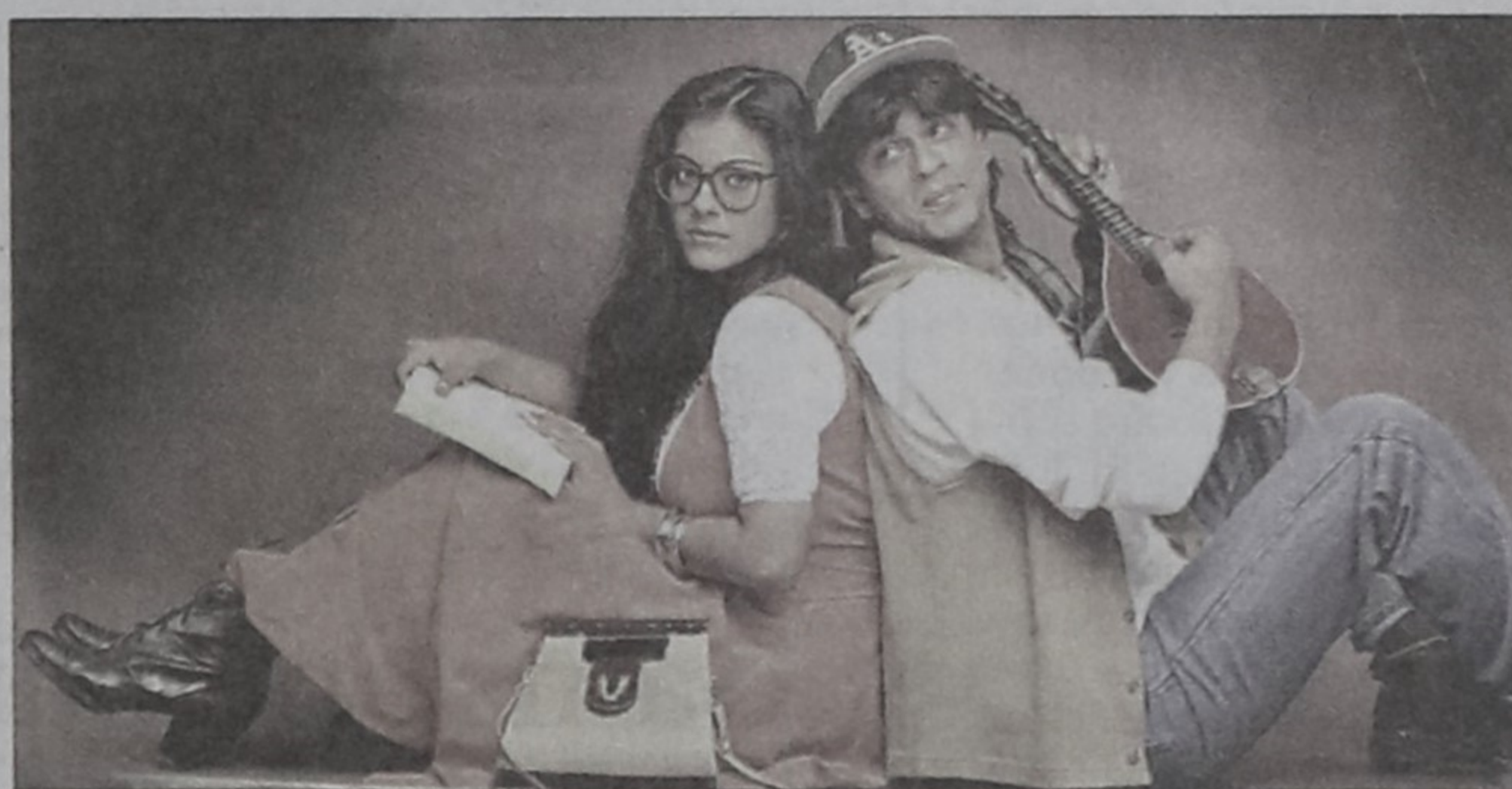
Kajol and Shah Rukh will be seen together after several years in "My Name is Khan."

The most controversial movie of Karan Johar titled "My Name is Khan" is almost complete but the director had to face many ups and downs during the shooting. Visa problems for the Muslim cast, music rights sharing