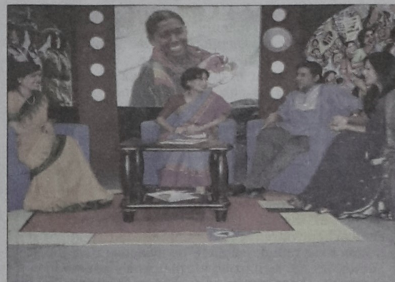
Discussants at the programme.