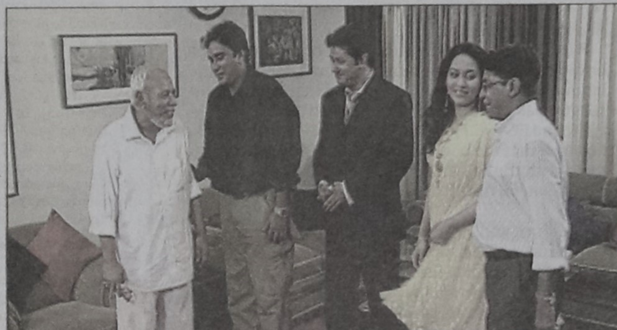
A scene from the TV play.

The cast includes ATM Shamsuzzaman, Zahid Hassan, Azizul Hakim, Shahiduzzaman Selim, Tarin and others. The play has been written and directed by Hanif Sanket.