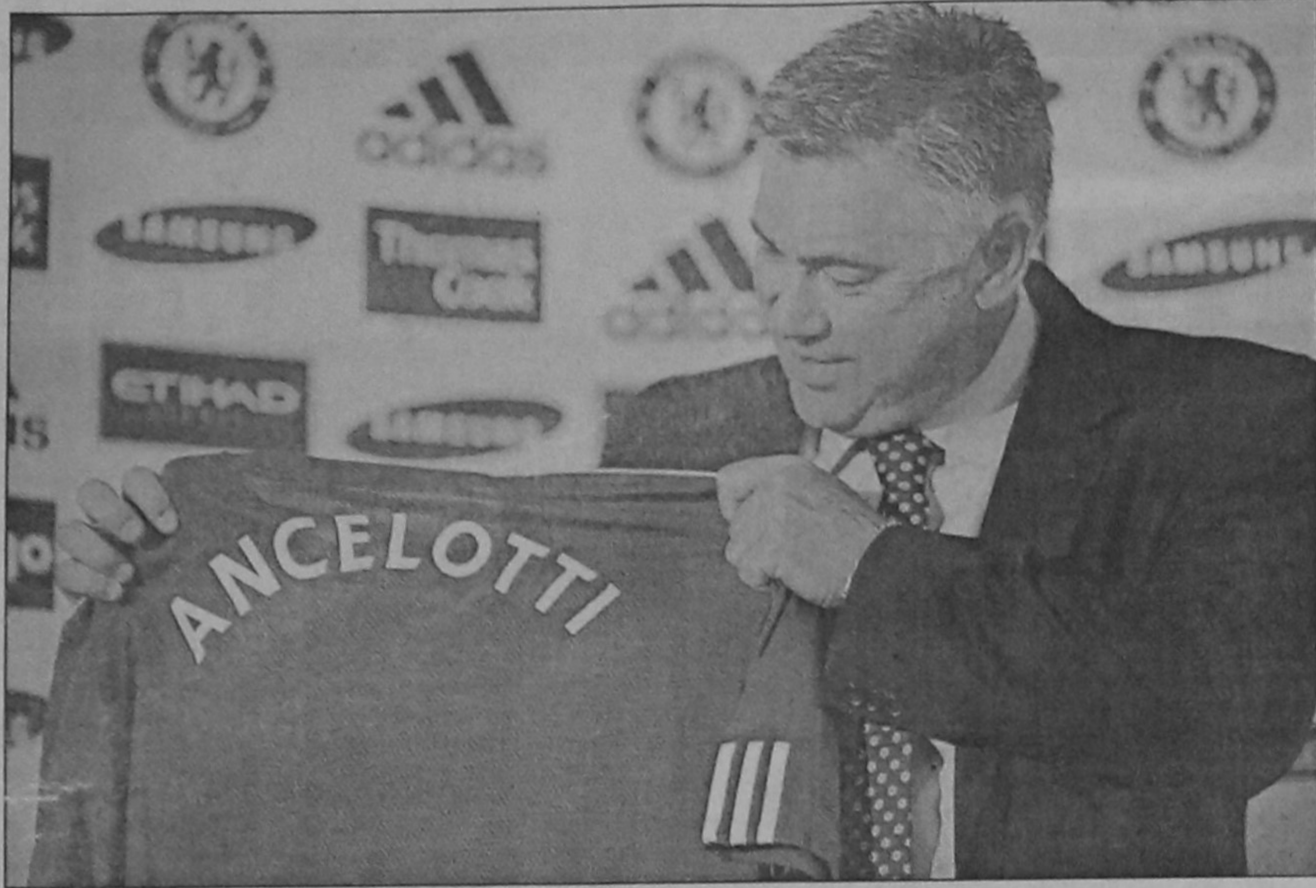
Chelsea's new manager Carlo Ancelotti holds up a team shirt during his first media conference at the Chelsea football club ground in London on Monday.

"That is a lie," he said. "I have a heel problem and also a blister. I want to get back training as soon as possible."