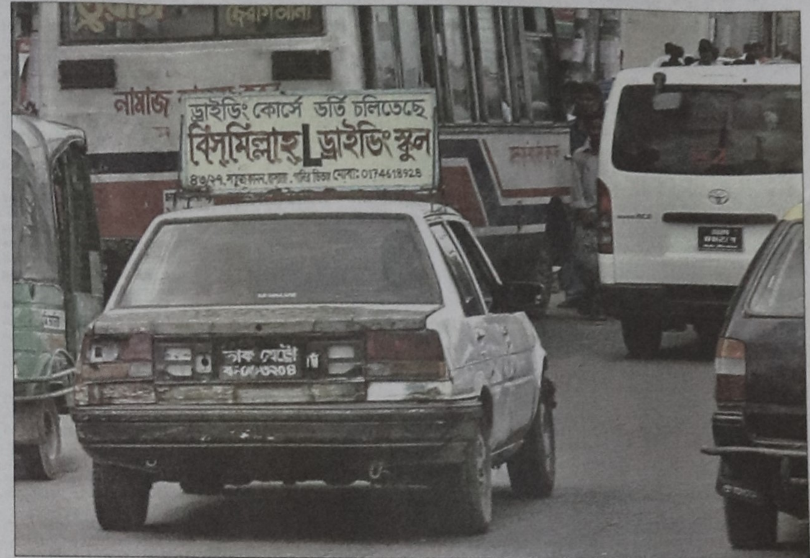
Driving schools, mostly unregistered, use run-down cars to teach trainees, putting both the learners and commuters at great risk. This picture was taken from the city's Mugdipara area.