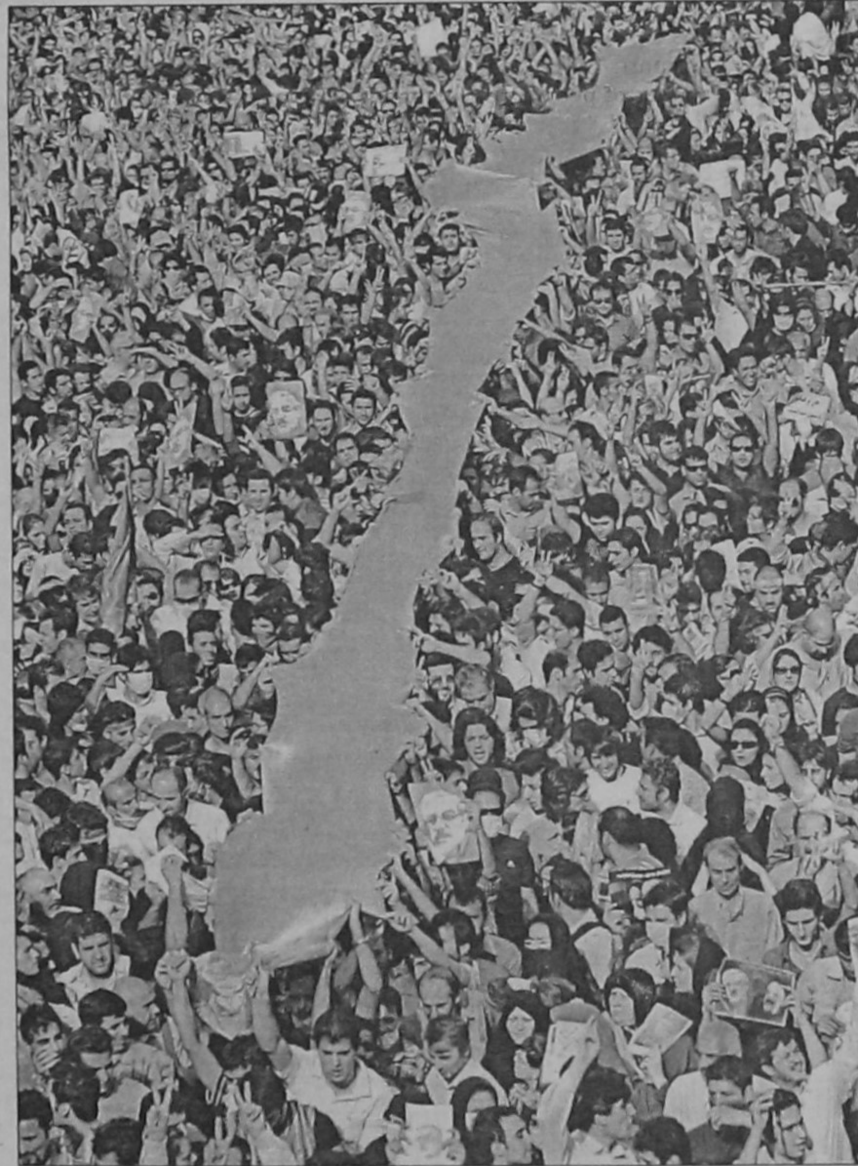
The Iranians can manage their own affairs.

In any case, the outside powers should not get involved in the internal affairs of Iran or any other country. The world still recalls how the UK and the US got involved in a coup for re-installing pro-Western Shah of Iran in 1953. Similar things have happened in Latin America and elsewhere. So, why lecture others on democracy? It is good that President Obama decided not to lecture, but to listen.