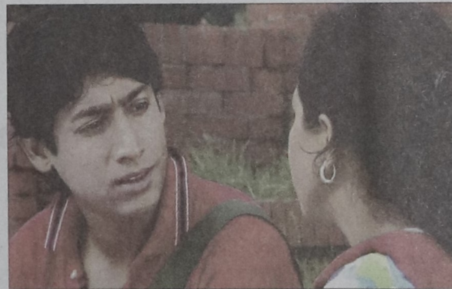
A scene from the serial.