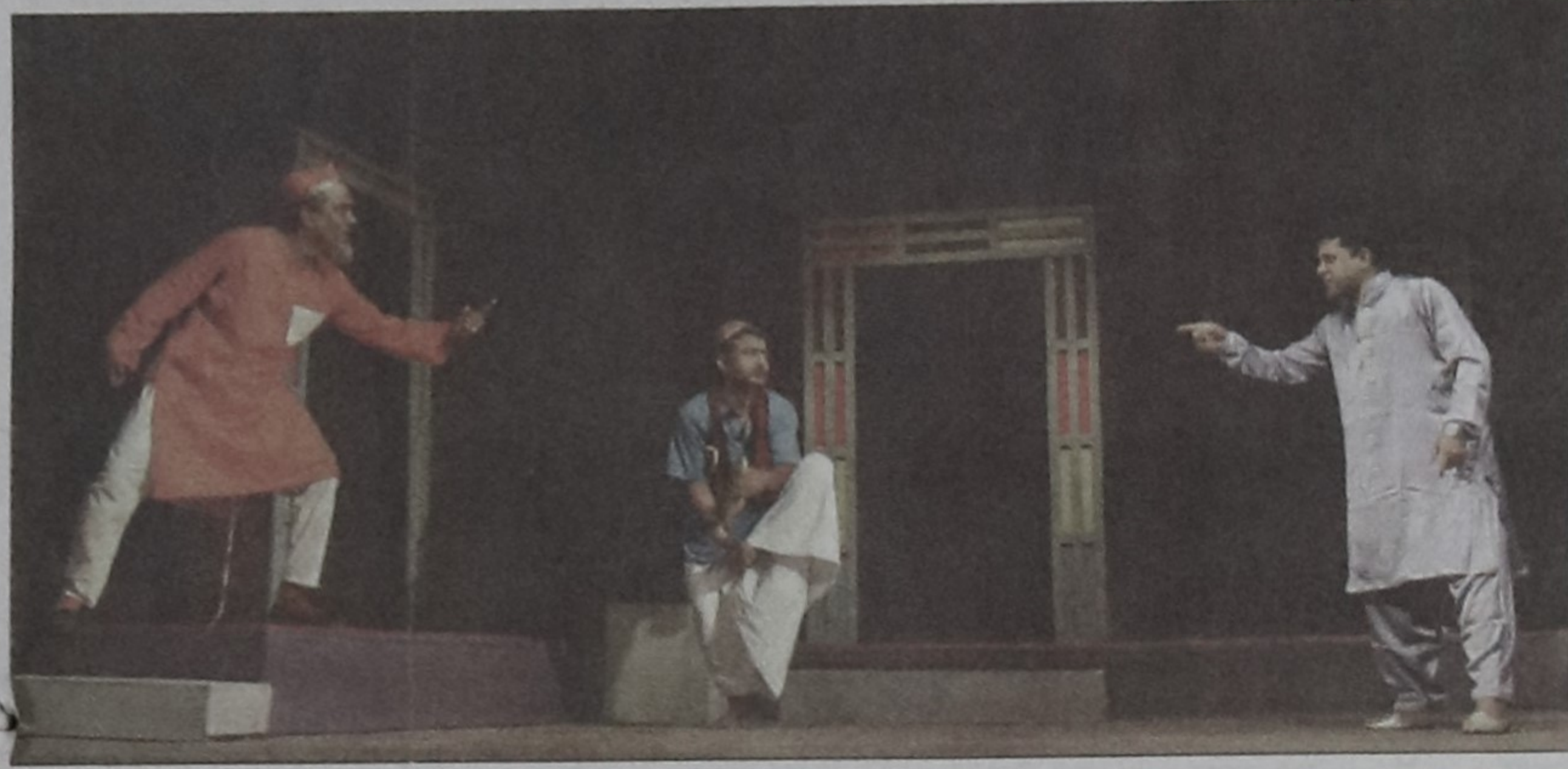
Loko Natyadal's "Kanjush" is the first production in Bangladesh to have more than 500 shows.