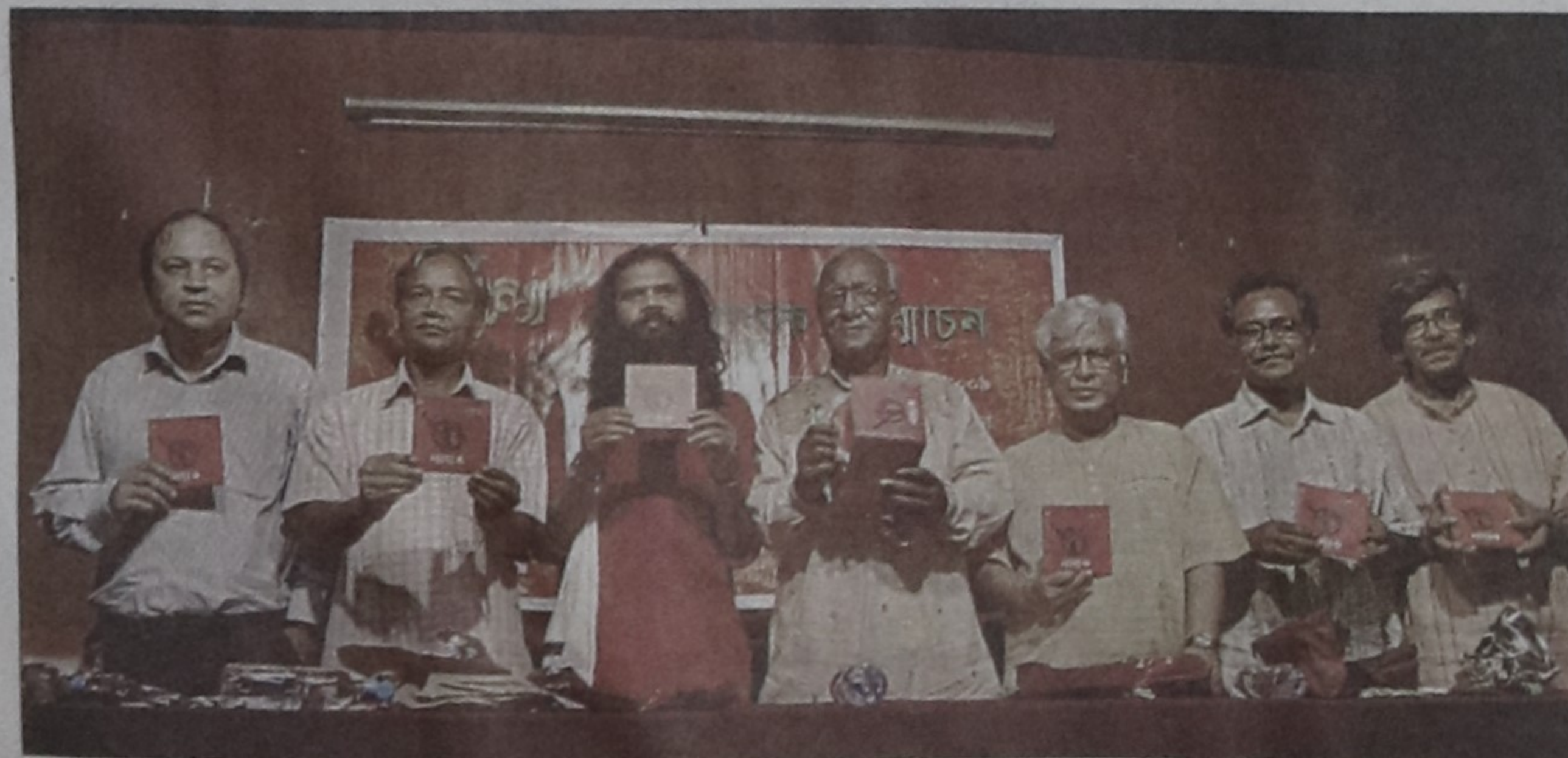
"Nayak," debut album of the Leela, was launched at the programme.