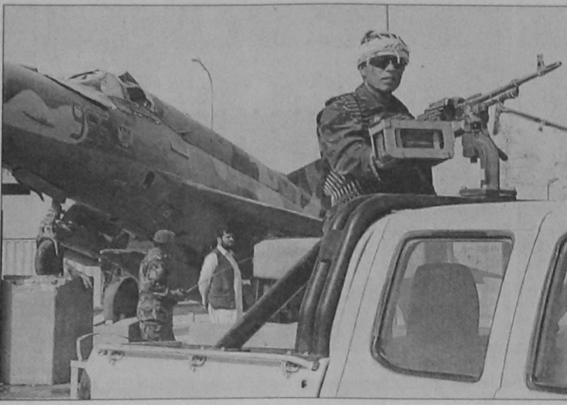
An Afghan National Army (ANA) soldier keeps watch at the site of a suicide attack near the main gate to a Nato military base in Kandahar province yesterday. A suicide car bomb exploded near the main gate of the military base in the southern city, killing two Afghans.