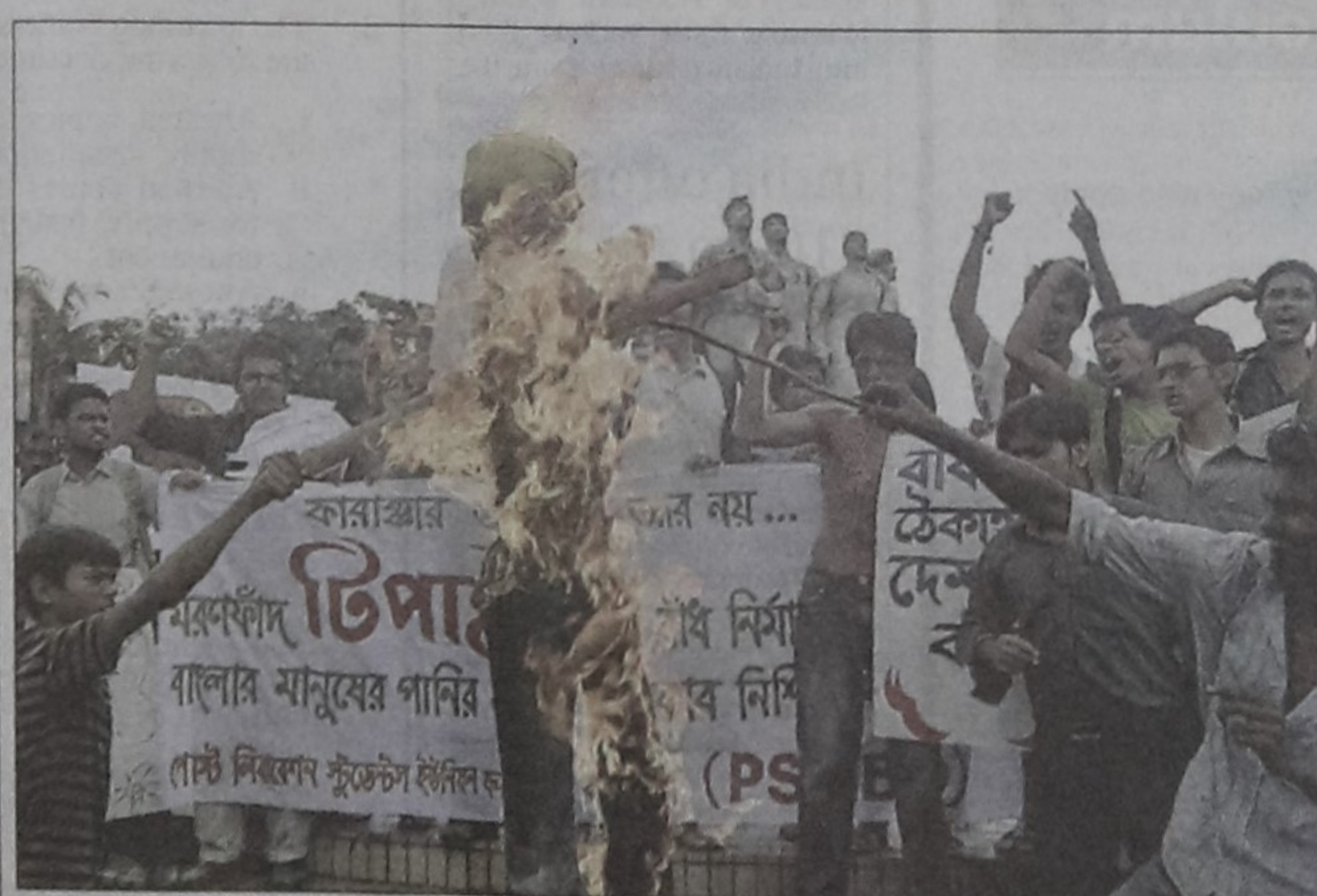
Post Liberation Students Union for Better Bangladesh burns the effigy of the Indian high commissioner in front of Teacher-Student Centre (TSC) on Dhaka University campus yesterday protesting his comments about local experts.