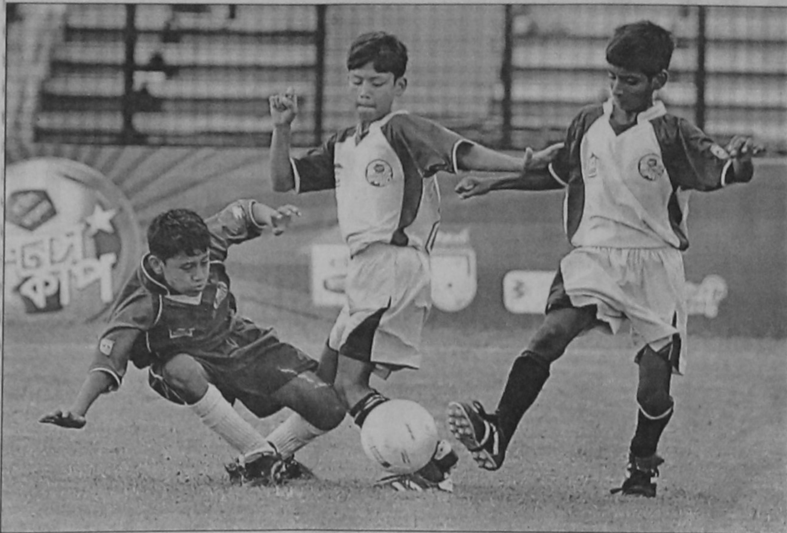
Kids fight for the possession of the ball during a Grameen-Danone Nations Cup juvenile tournament between Narayananj and Chapainawabganj at the Bangabandhu National Stadium yesterday.