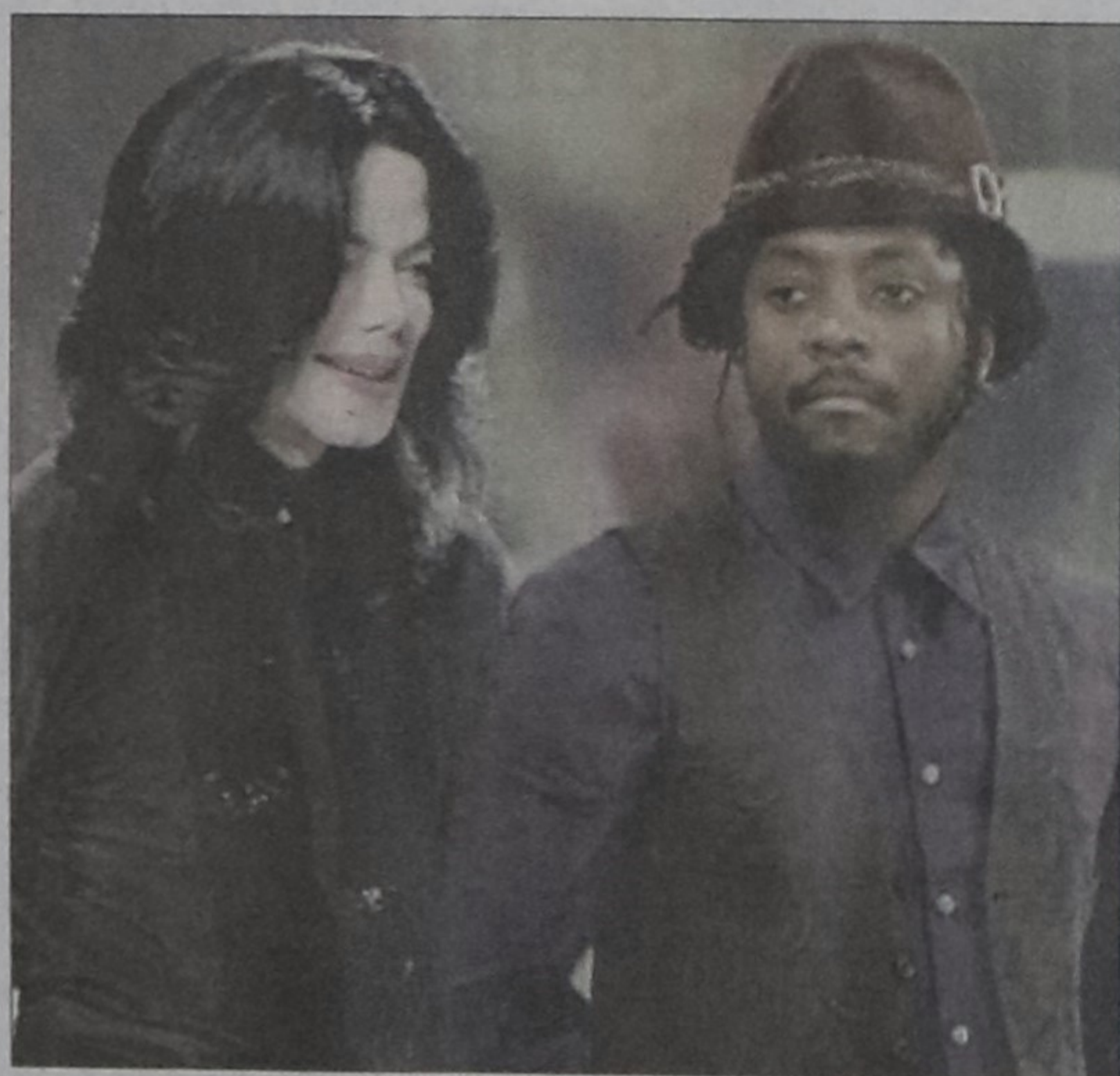
The Black Eyed Peas frontman Will.i.am (right) was collaborating with Jackson on new songs.