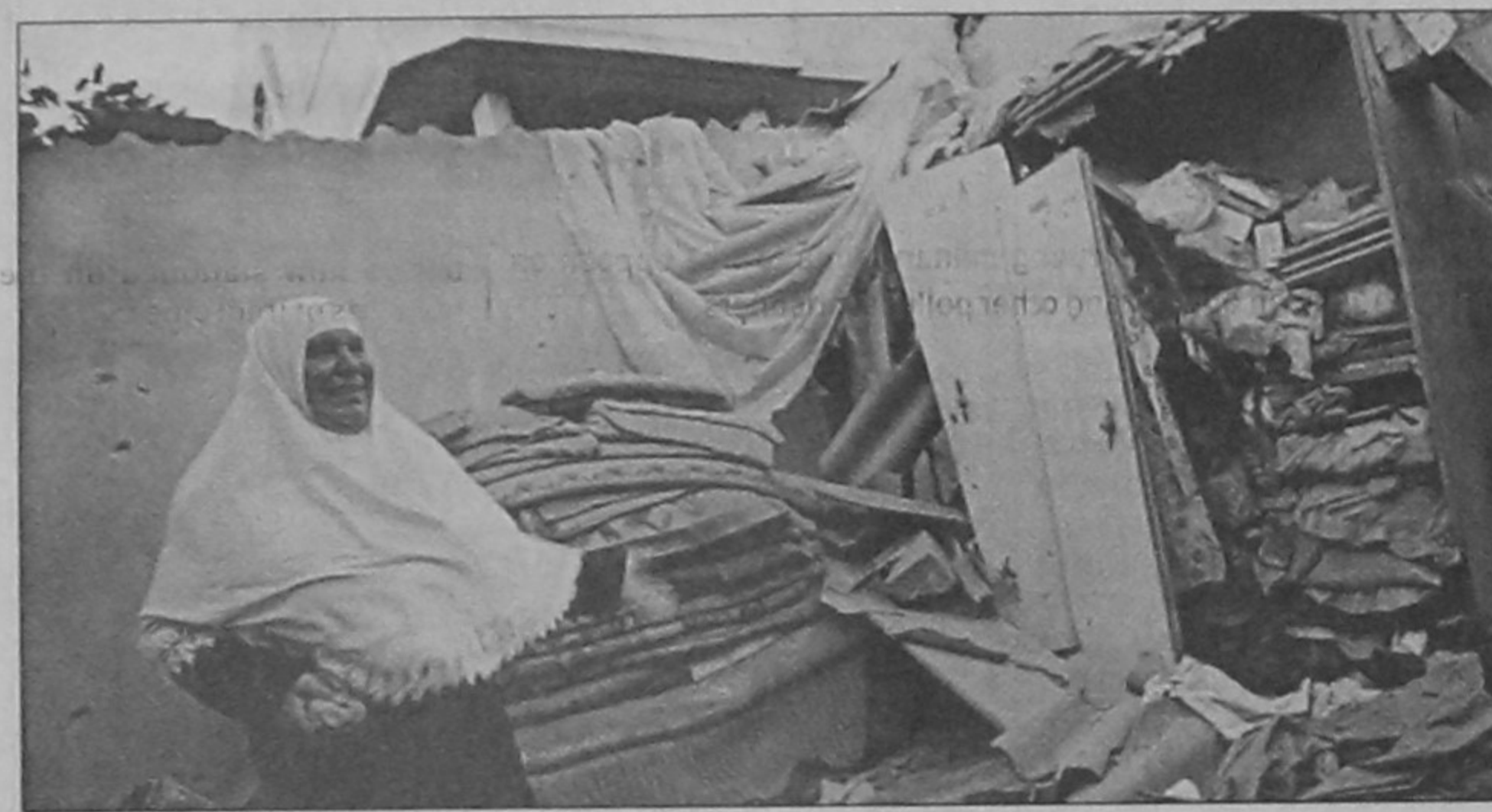
A Palestinian woman reacts to the damage her house sustained from Israeli fire in Moghraqa, in central Gaza, on Thursday. A 17-year-old youth was killed in the Gaza Strip as a shell fired from an Israeli tank struck him.

"They could find that obtaining a visa could be more difficult while the British embassy staff remain in detention," the diplomat said.