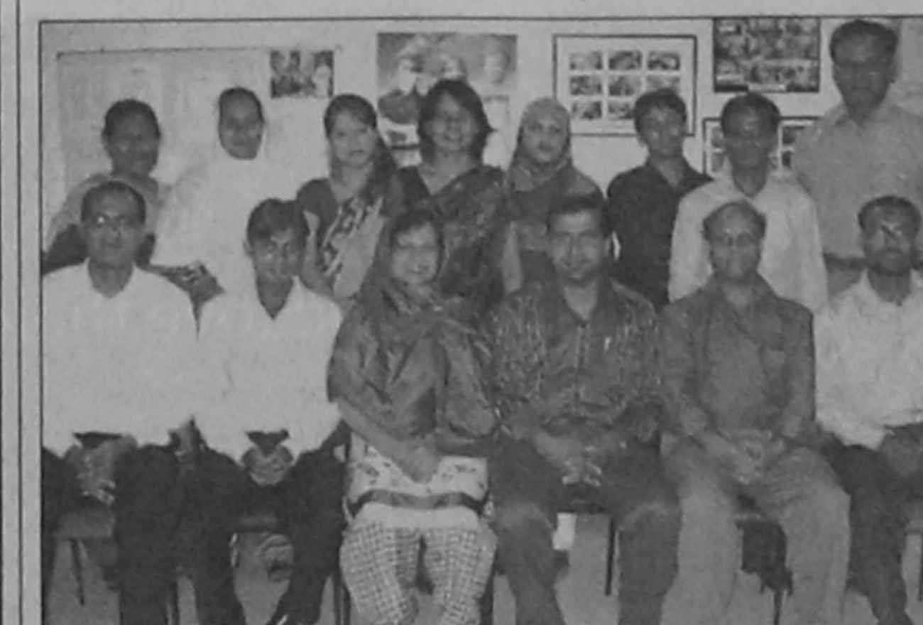
Participants of a Training of Trainers (ToT) workshop on teaching with emerging technologies pose for photograph at computer lab of Presidency University in the city yesterday. Bangladesh English Language Teachers' Association (BELTA) and English Department of Presidency University jointly organised the workshop.

The meeting was followed by a cultural function.