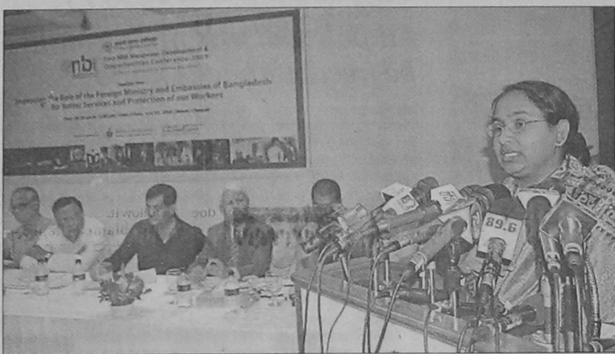
Foreign Minister Dipu Moni speaks at a seminar on 'Improving the role of the foreign ministry and embassies of Bangladesh for better services and protection of our workers' at a city hotel yesterday. Scholars Bangladesh and Human Capital Development Limited jointly organised the seminar.

On the occasion, a doa mahfil and Qurankhwani will be held at her home at Baherpara in Tongbari and at a local mosque.