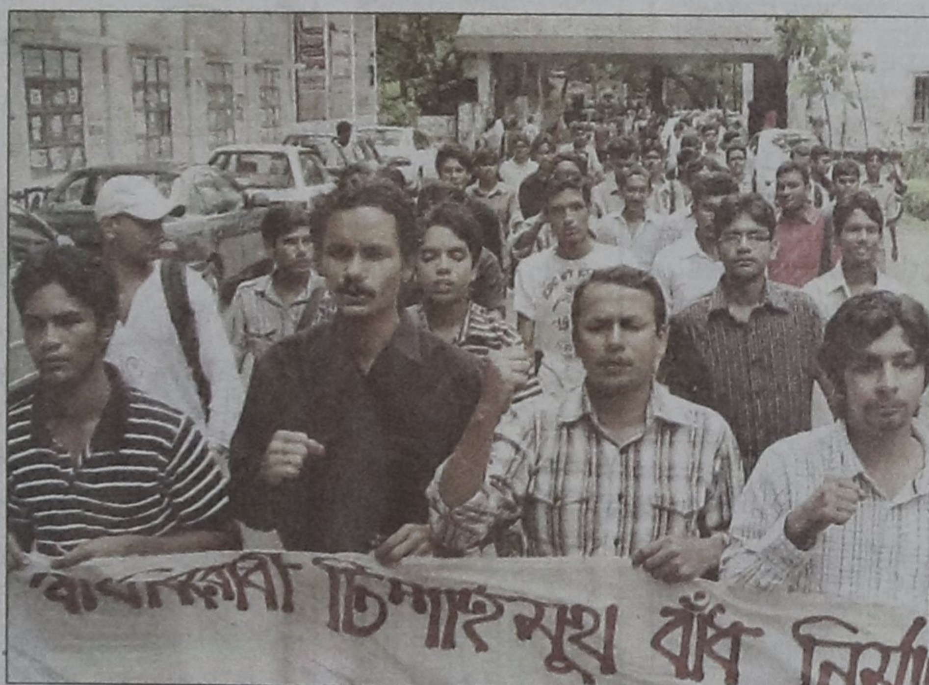
Bangladesh Chhatra Union stages a demonstration on the Dhaka University campus yesterday protesting the Indian move to construct Tipaimukh dam.

The 'user fee' given by the patients is not used to improve the health services, the speakers said adding that budgetary allocation should be increased to provide quality health services.