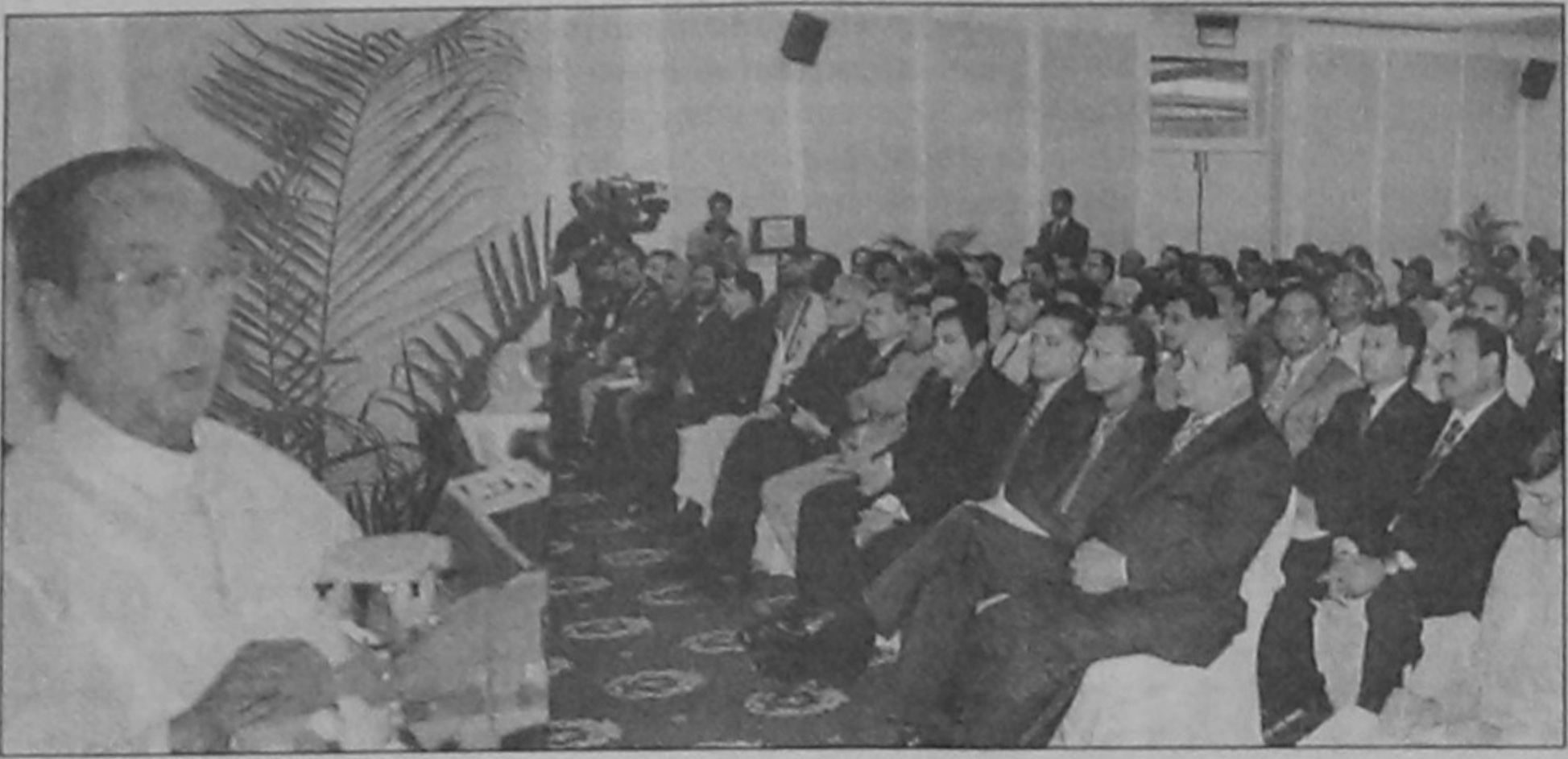
President Zillur Rahman addresses the 'First NRB Manpower Development and Opportunities Conference-2009' at Dhaka Sheraton Hotel yesterday.