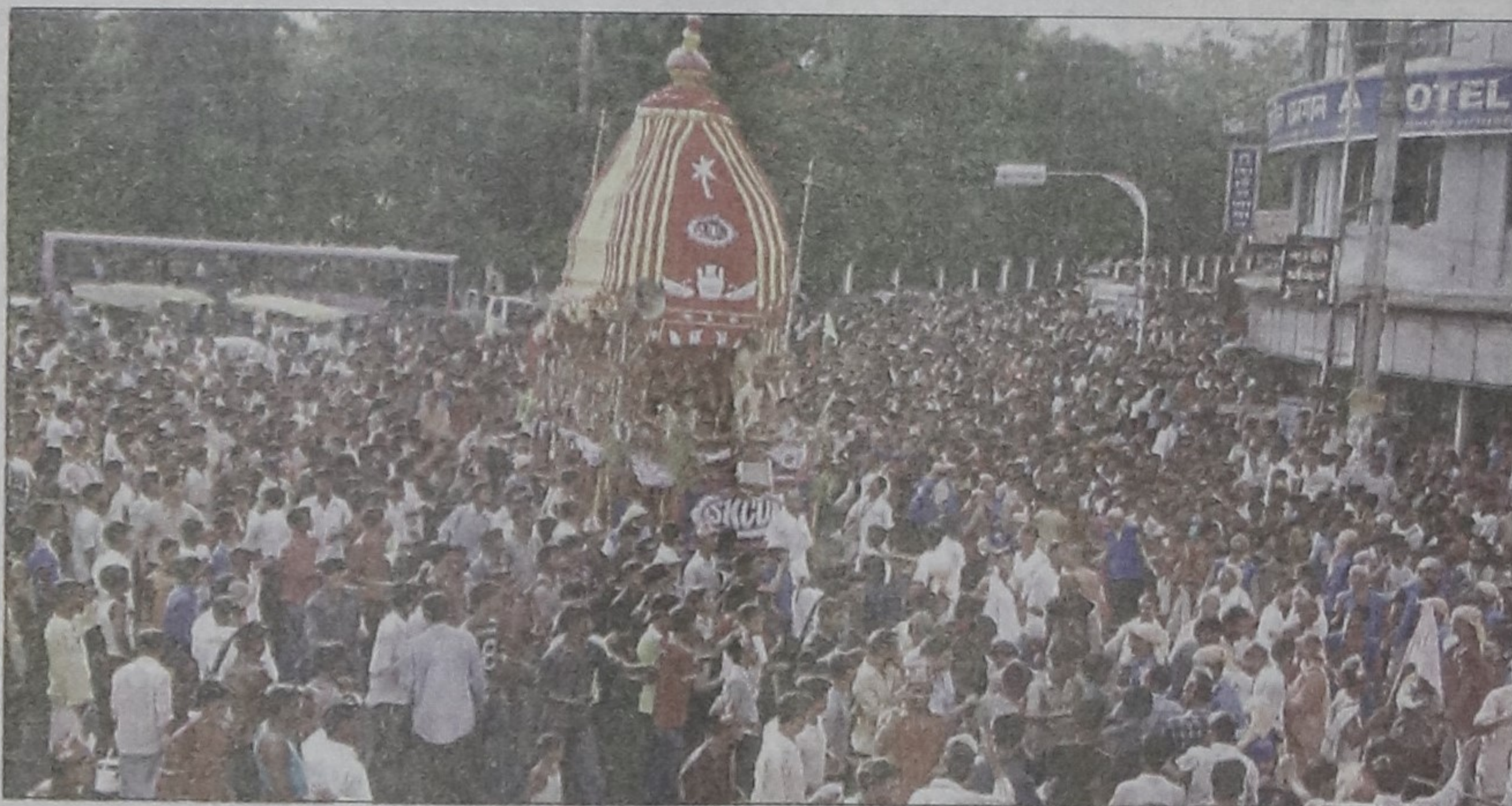
Hindu devotees pull a chariot during a Rath Jatra festival in the port city on June 24. The picture was taken from the Kazir Dewri intersection.