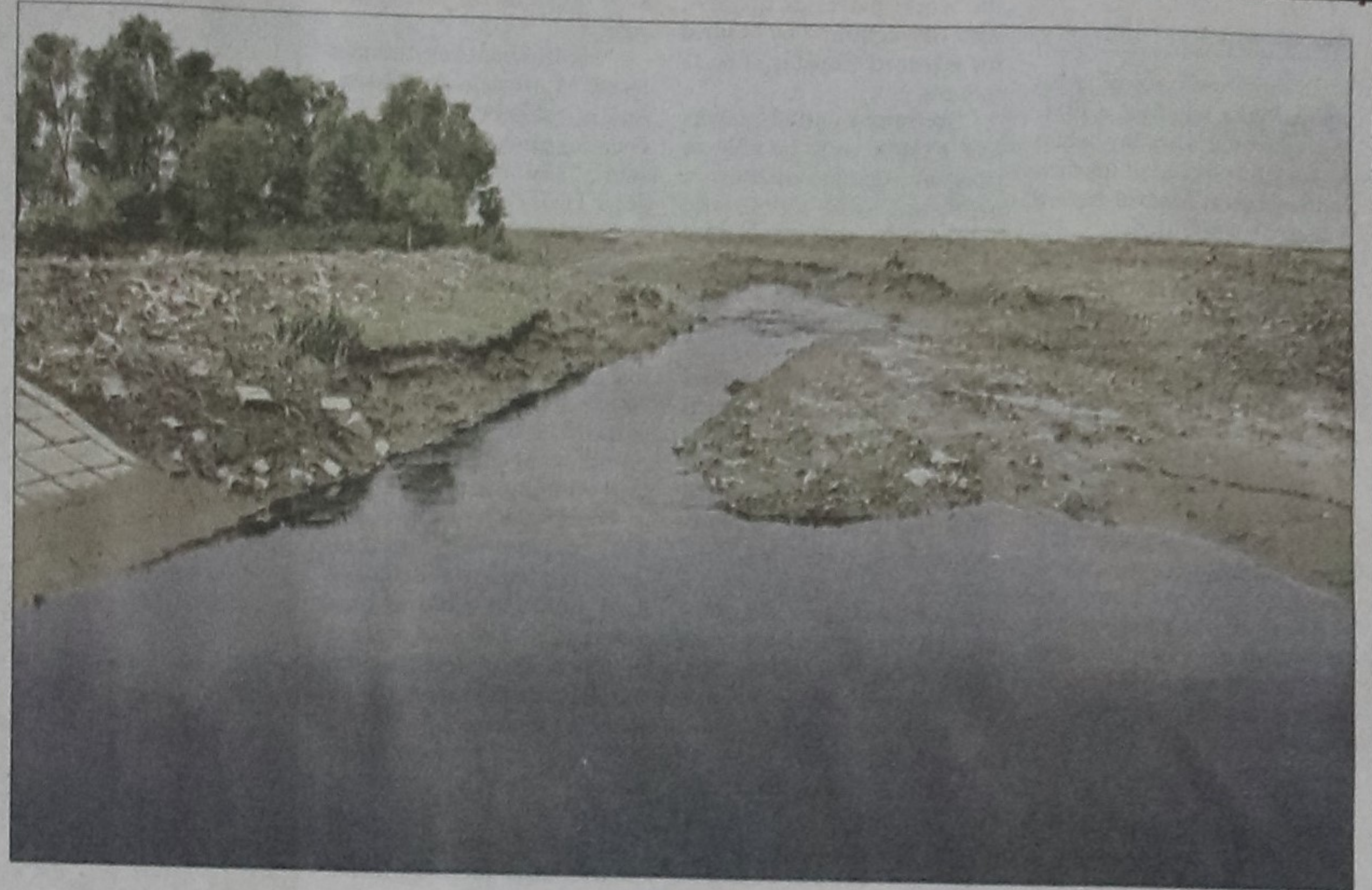
Untreated effluents from some 100 industrial units at Chittagong Export Processing Zone (CEPZ) continue to pollute water of the nearby canals and find ultimate destination in the Bay of Bengal. The Photo was taken from a CEPZ adjoining canal on Sunday.

Following the study, JBIC signed an agreement with the Economic Relation Department (ERD) in 2007 to develop Chittagong City Ring Road project titled "Multi-sector infrastructure development in Chittagong."