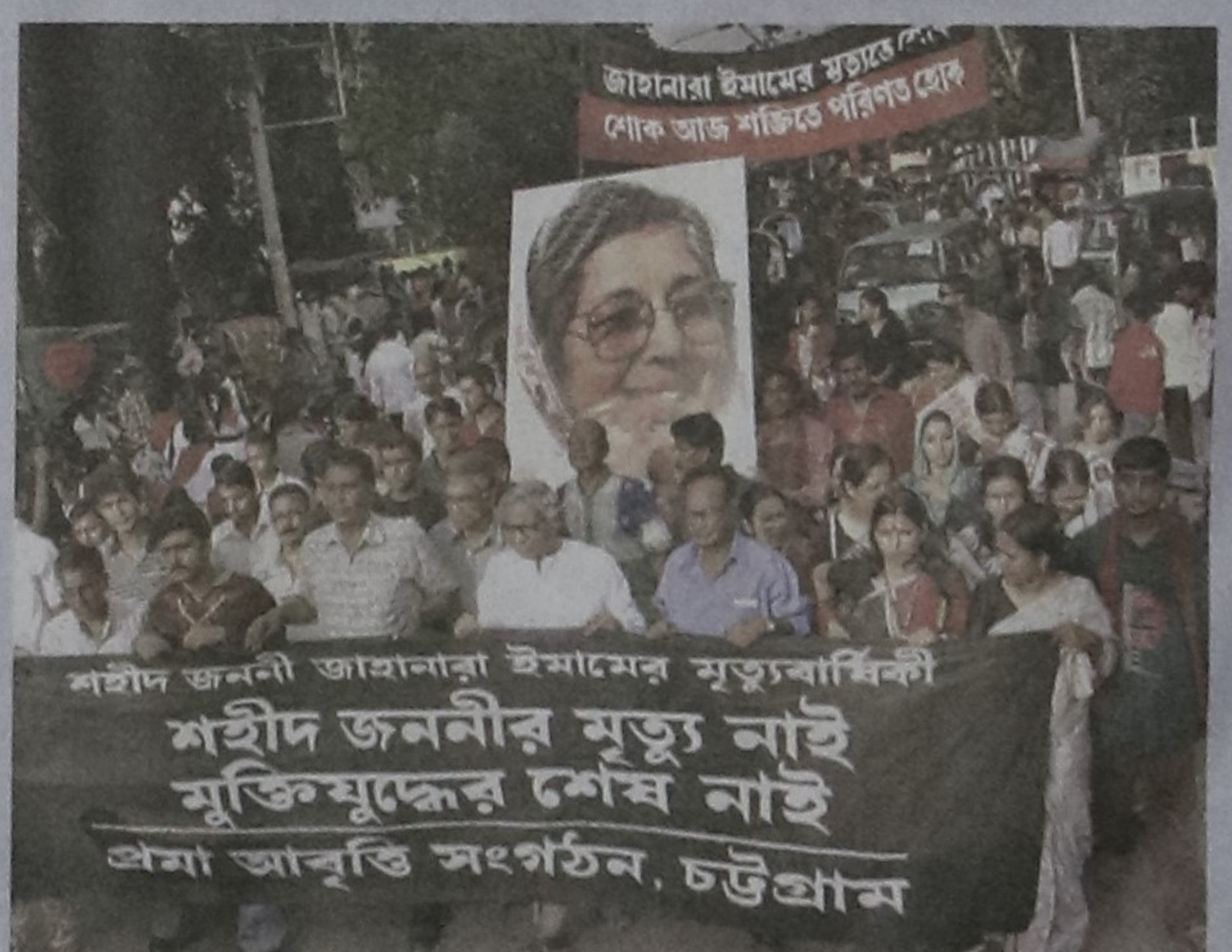
Proma Abritti Sangathan, a recitation organisation, takes out a procession from central Shaheed Minar in the port city on June 26 marking the 15th death anniversary of Shaheed Janani Jahanara Imam.