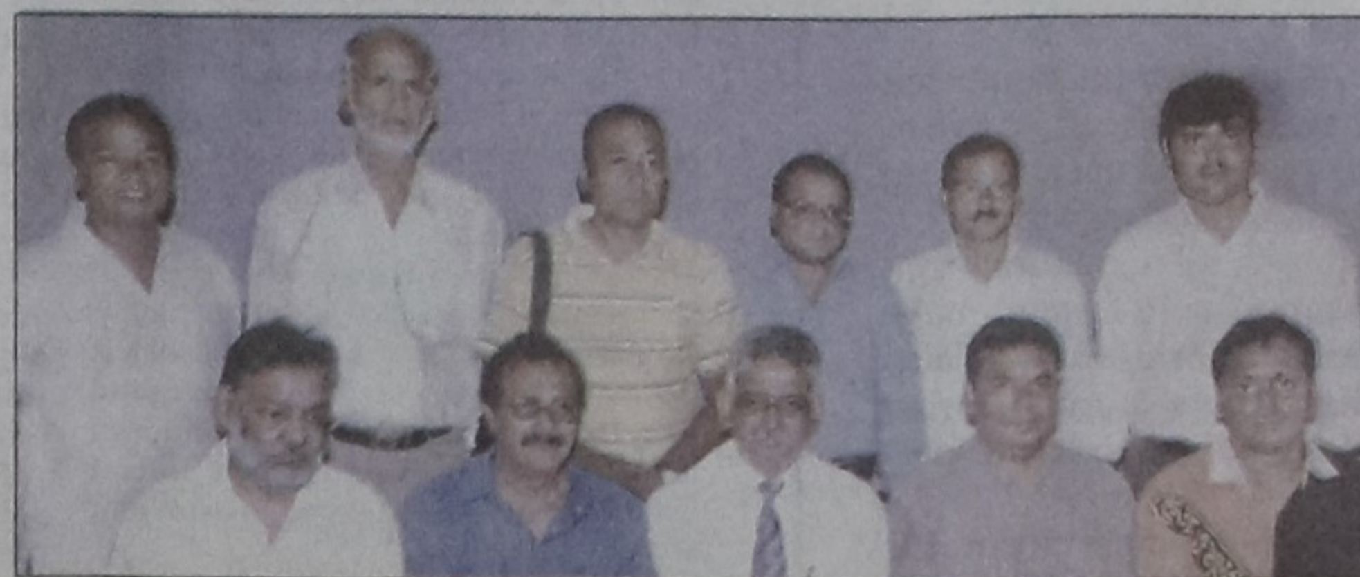
The Bangladeshi delegation to Nepal.

The exhibition will highlight culture and heritage of Bangladesh. The Bangladesh delegation will meet the Nepalese president and attend an international seminar organised by South Asian Photo Journalists' Association during the trip.