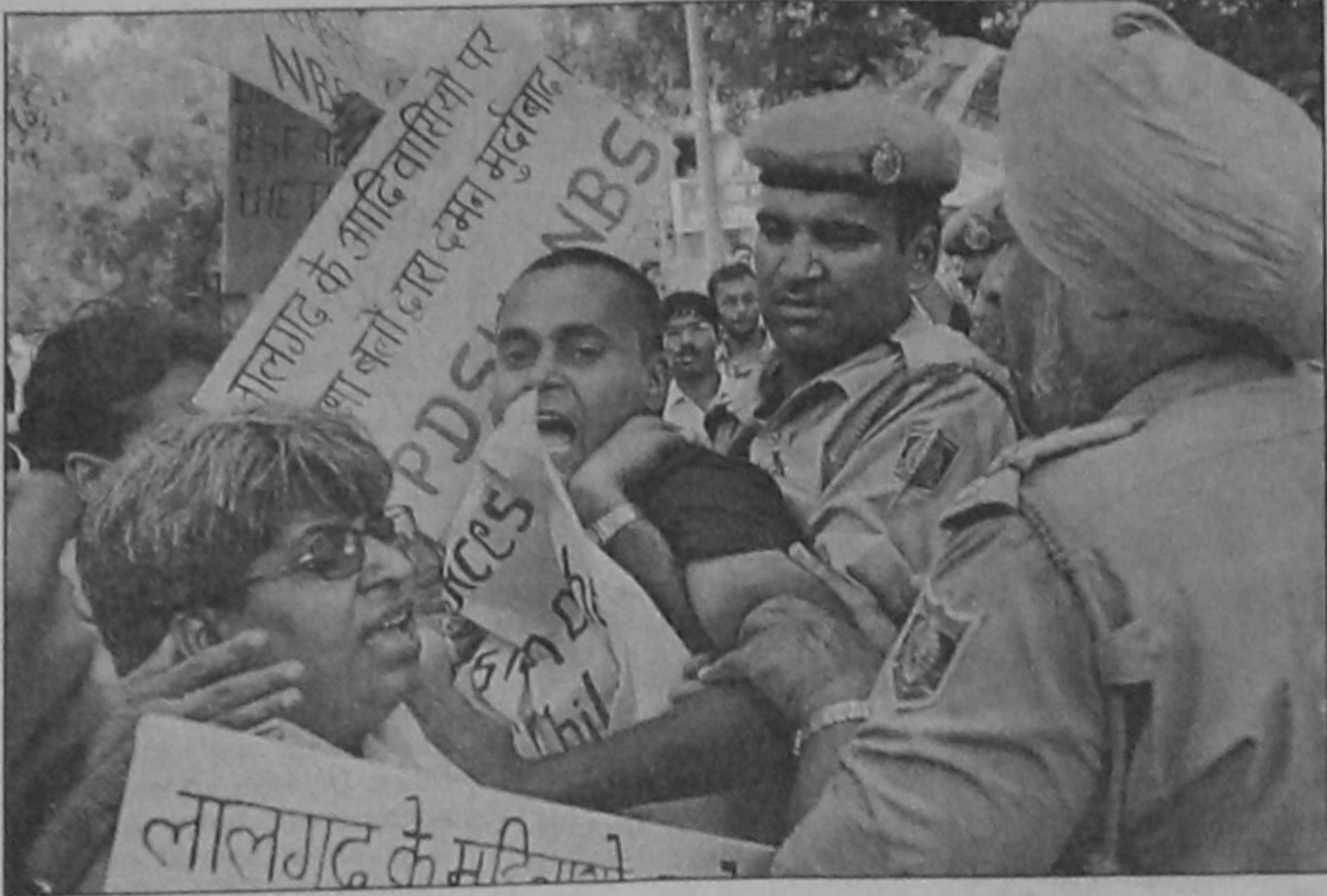
Indian pro-Maoist demonstrators scuffle with police officials during protest outside the Communist Party of India (Marxist) office in New Delhi yesterday.