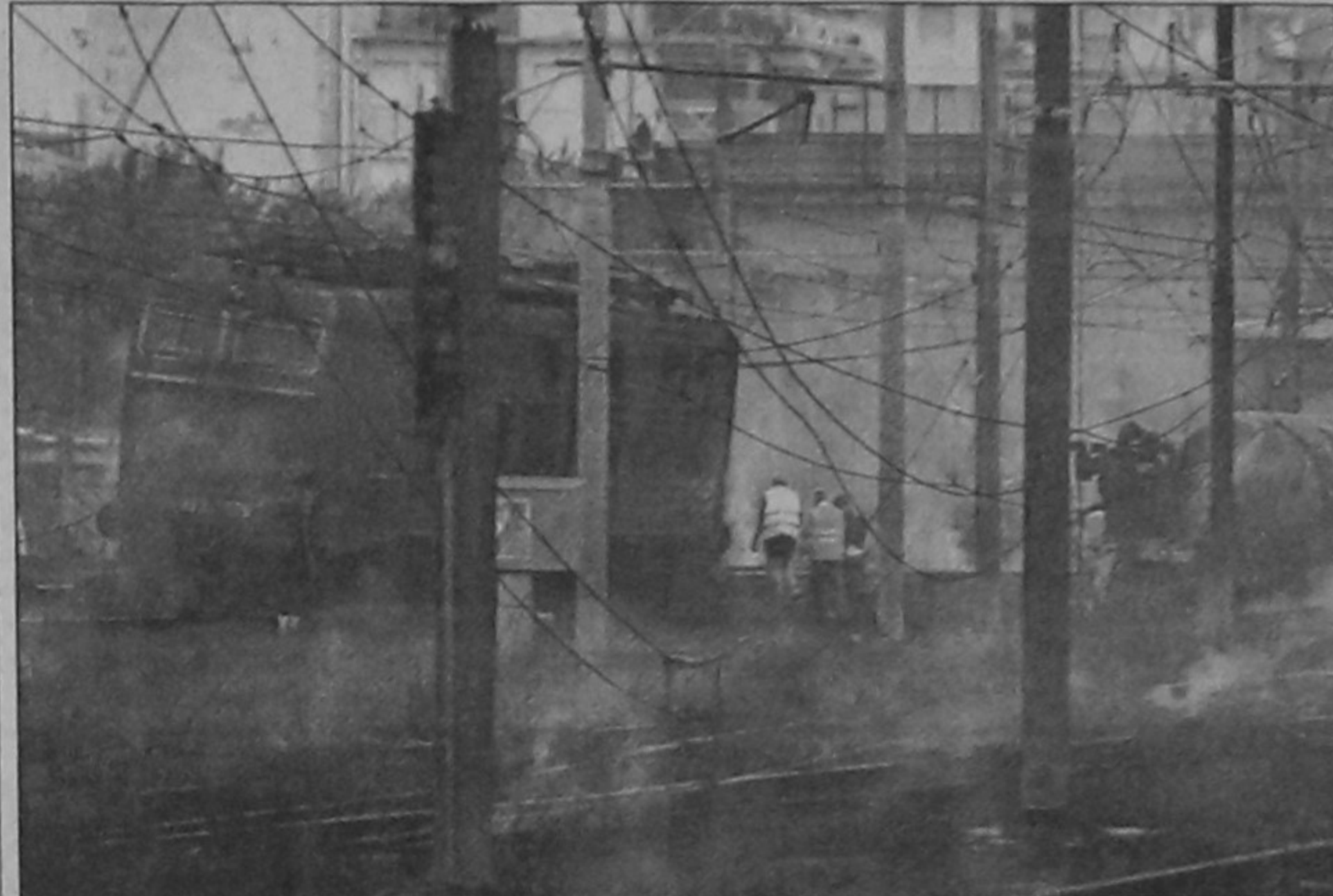
Rescuers stand near a wrecked wagon of two gas-filled rail tankers that exploded after derailling yesterday in the seaside resort of Viareggio in northern Italy. At least 15 people were killed and dozens more injured in the accident.

flooded in the streets in protests that were put down through a show of force by riot police and pro-government militiamen. Mousavi has made few public appearances since then and said he would seek official approval for rallies. The cleric-led government has said Ahmadinejad will be sworn in for a second term as early as July 26. Asked if the United States would recognise Ahmadinejad as Iran's legitimate president, US Secretary of State Hillary Rodham Clinton said "We're going to take this a day at a time." Monday's recount appeared to be an attempt to cultivate the image that Iran was seriously addressing fraud claims, while giving no ground in the clampdown on opposition.