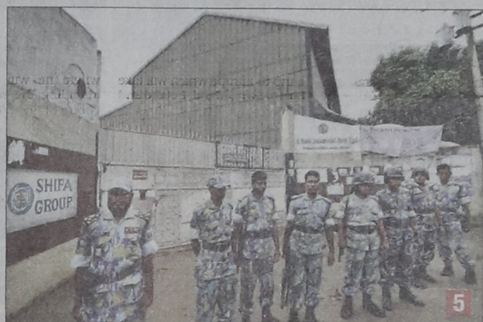
1) All the machines of Ha-Meem Group at Ashulia burn down as garment workers set fire to six factories of the company on Monday during demonstrations over pay-hike. 2) A firefighter tries to douse flames inside a factory of the company yesterday. 3) Workers throng the factory premises yesterday morning. 4) Worried workers gather in front of the factory. 5) Law enforcers stand guard in front of a garment factory in the area to avert further violence.