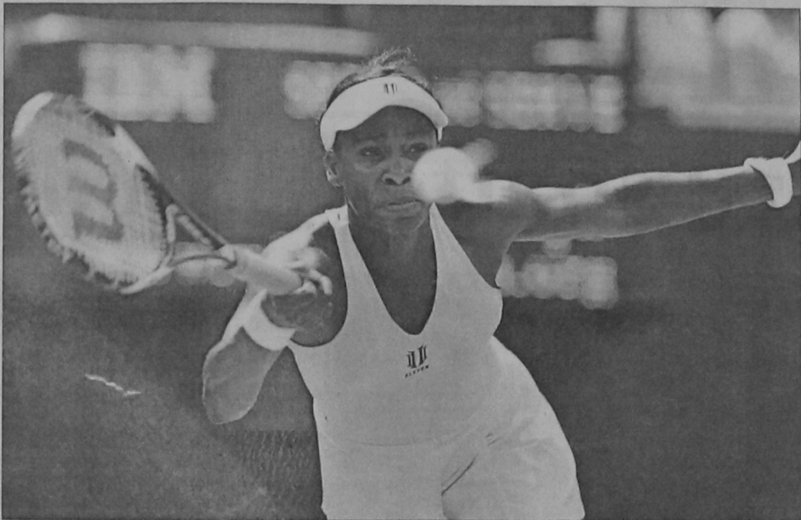
American defending champion Venus Williams plays a forehand against Serbia's Ana Ivanovic during their Wimbledon round of 16 match at the All England Club in London yesterday.

Boris Becker accomplished three feats in 1985 - he became the youngest men's Wimbledon singles champion (17 years, 227 days old), the first German champion, and the first unseeded champion.