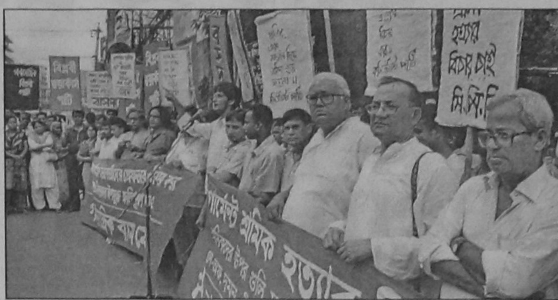
Democratic Left Alliance, CPB and Workers Party jointly stage a demonstration at Muktangan in the city yesterday protesting killing of garment workers in Ashulia.