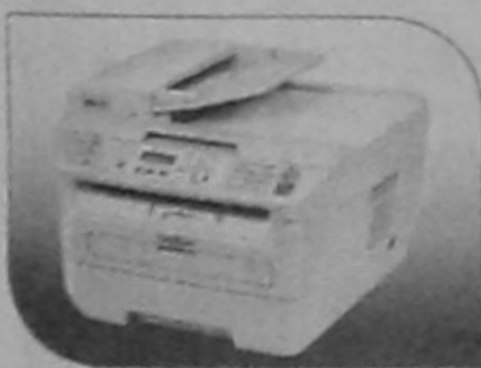
MFC-7340 5-in-1 Print, Fax, Copy, Colour Scan, PC Fax

Print/Copy Speed : 20 ppm Print Resolution : 2400 x 600 dpi Fax : 33.6 KB/s Super G3 Paper Tray : 250 Sheets Interface Type : USB 2.0 Automatic Document Feeder : Up to 35 sheets