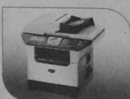
MFC-8860DN 5-in-1 Print, Fax, Copy, Colour Scan, PC Fax+Duplex+Network

Print/Copy Speed : 28 ppm Print Resolution : 1200 x 1200 dpi Duplex : Print, Fax, Copy & Scan Fax : 33.6 KB/s Super G3 Paper Tray : 250 Sheets Interface Type : USB 2.0 & Parallel, Fast Ethernet 10/100 Automatic Document Feeder : Up to 50 sheets