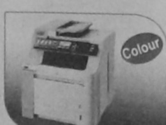
MFC-9440CN 5-in-1 Print, Fax, Copy, Scan, PC Fax+Network

Print Speed : 20 ppm Print Resolution : 2400 x 600 dpi Copy Speed : 16 ppm Fax : 33.6 KB/s Super G3 Paper Tray : 250 Sheets Interface Type : USB 2.0, Fast Ethernet 10/100 Automatic Document Feeder : Up to 35 sheets