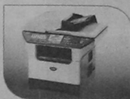
MFC-8460N 5-in-1 Print, Fax, Copy, Colour Scan, PC Fax+Network

Print/Copy Speed : 28 ppm Print Resolution : 1200 x 1200 dpi Fax : 33.6 KB/s Super G3 Paper Tray : 250 Sheets Interface Type : USB 2.0 & Parallel, Fast Ethernet 10/100 Automatic Document Feeder : Up to 50 sheets