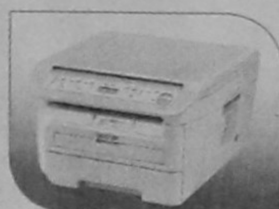
DCP-7030 3-IN-1 PRINT, COPY, COLOUR SCAN

Print/Copy Speed : 22 ppm Print Resolution : 2400 x 600 dpi Paper Tray : 250 Sheets Interface Type : USB 2.0