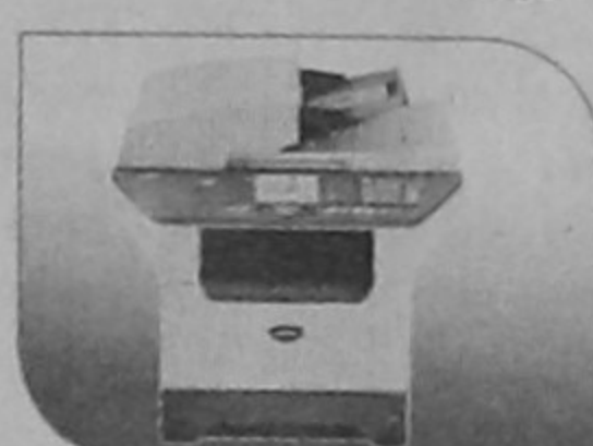
DCP-8060 3-IN-1 PRINT, COPY, COLOUR SCAN

Print/Copy Speed : 28 ppm Print Resolution : 1200 x 1200 dpi Paper Tray : 250 Sheets Interface Type : USB 2.0 & Parallel Automatic Document Feeder : Up to 50 sheets