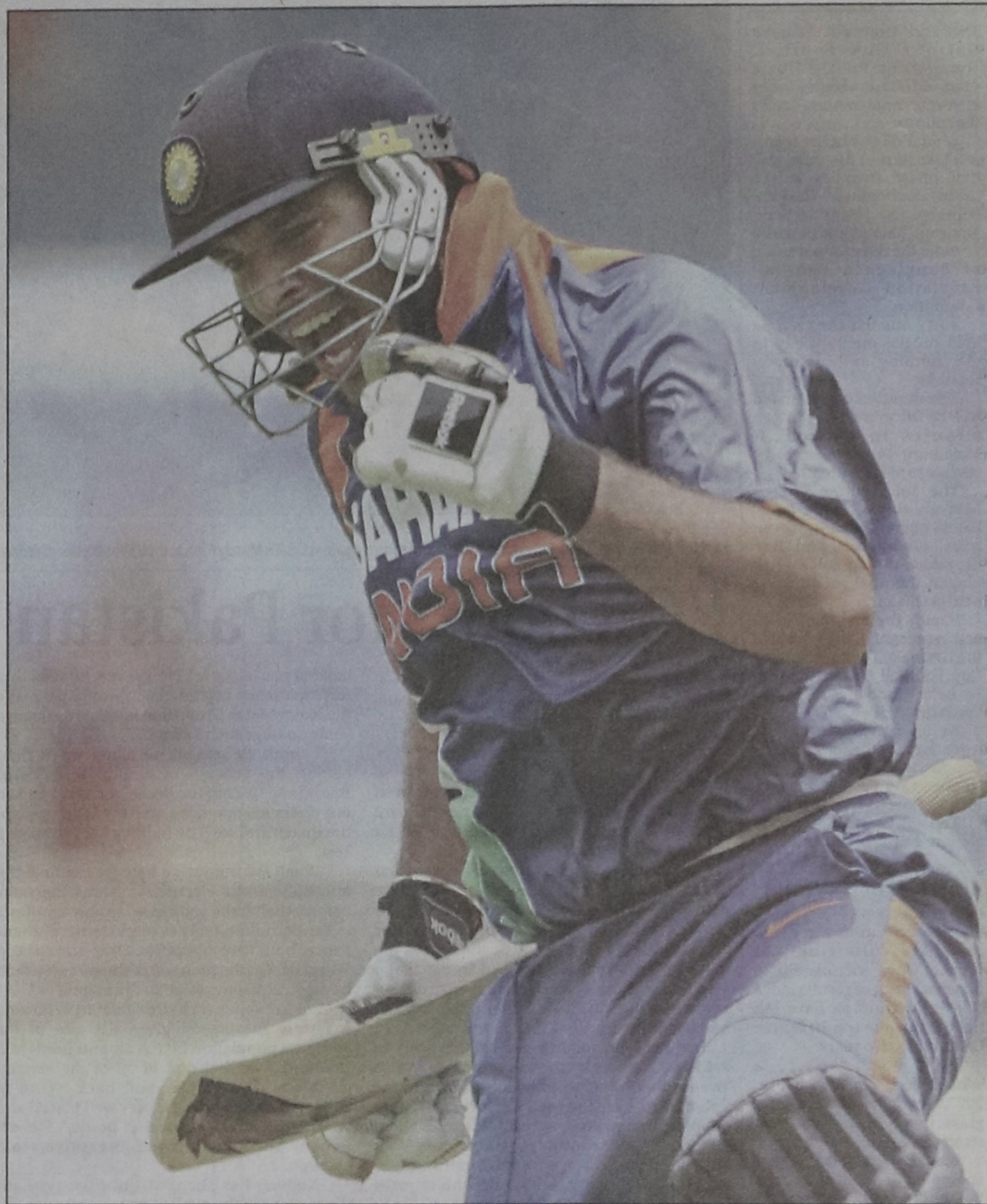
Indian star batsman Yuvraj Singh is ecstatic after scoring a rollicking century during the first one-day international against West Indies at the Sabina Park in Kingston on Friday. Yuvraj smashed 131 off 102 balls.