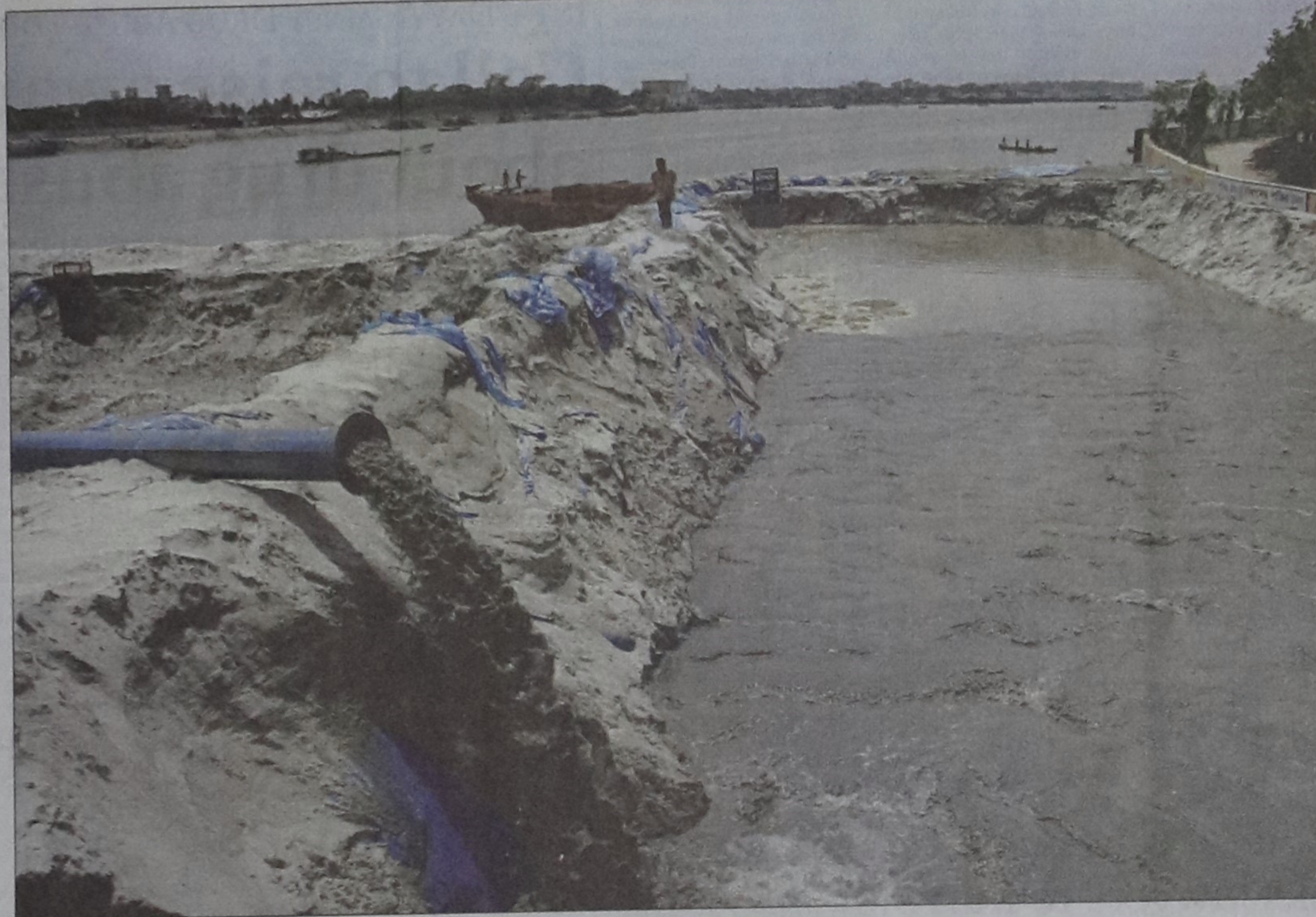
Defiant businessmen engage workers to illegally fill up a stretch of the River Buriganga near Postogola with sand, despite the continuing government drive against all kinds of encroachment.