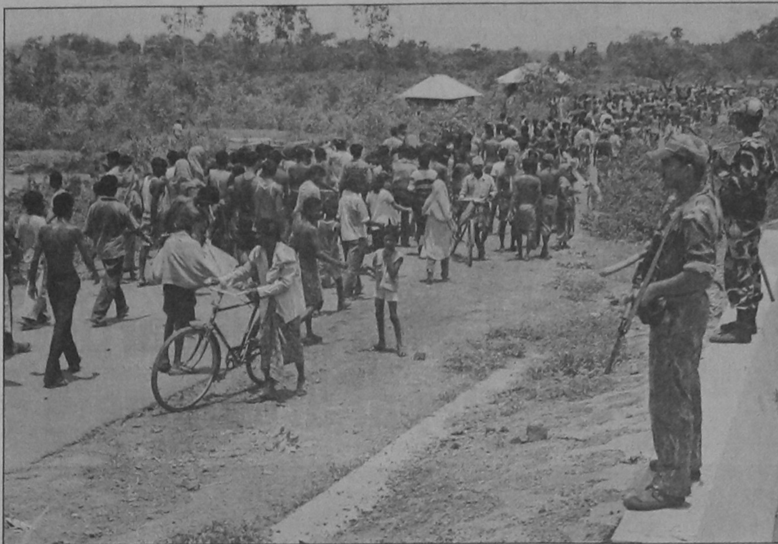
Indian paramilitary soldiers stand guard as villagers return after watching a helicopter transporting administrative officers at Lalgarh, in the Midnapore district, some 120km west of Kolkata yesterday.