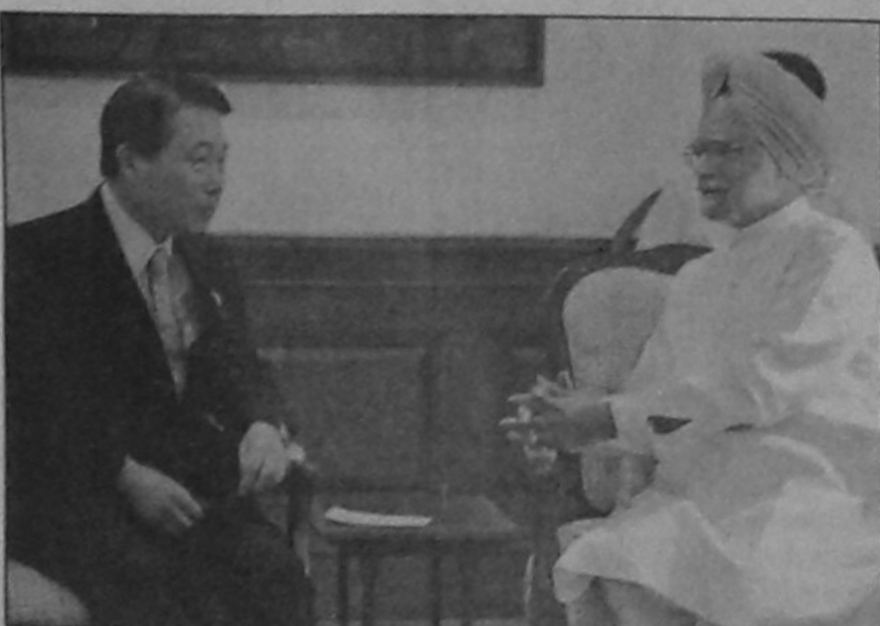
Indian Prime Minister Manmohan Singh (R) talks with South Korean Minister for Foreign Affairs and Trade Yu Myung-hwan during a meeting at Singh's residence in New Delhi yesterday. Myung-hwan is in India on a two-day official visit.