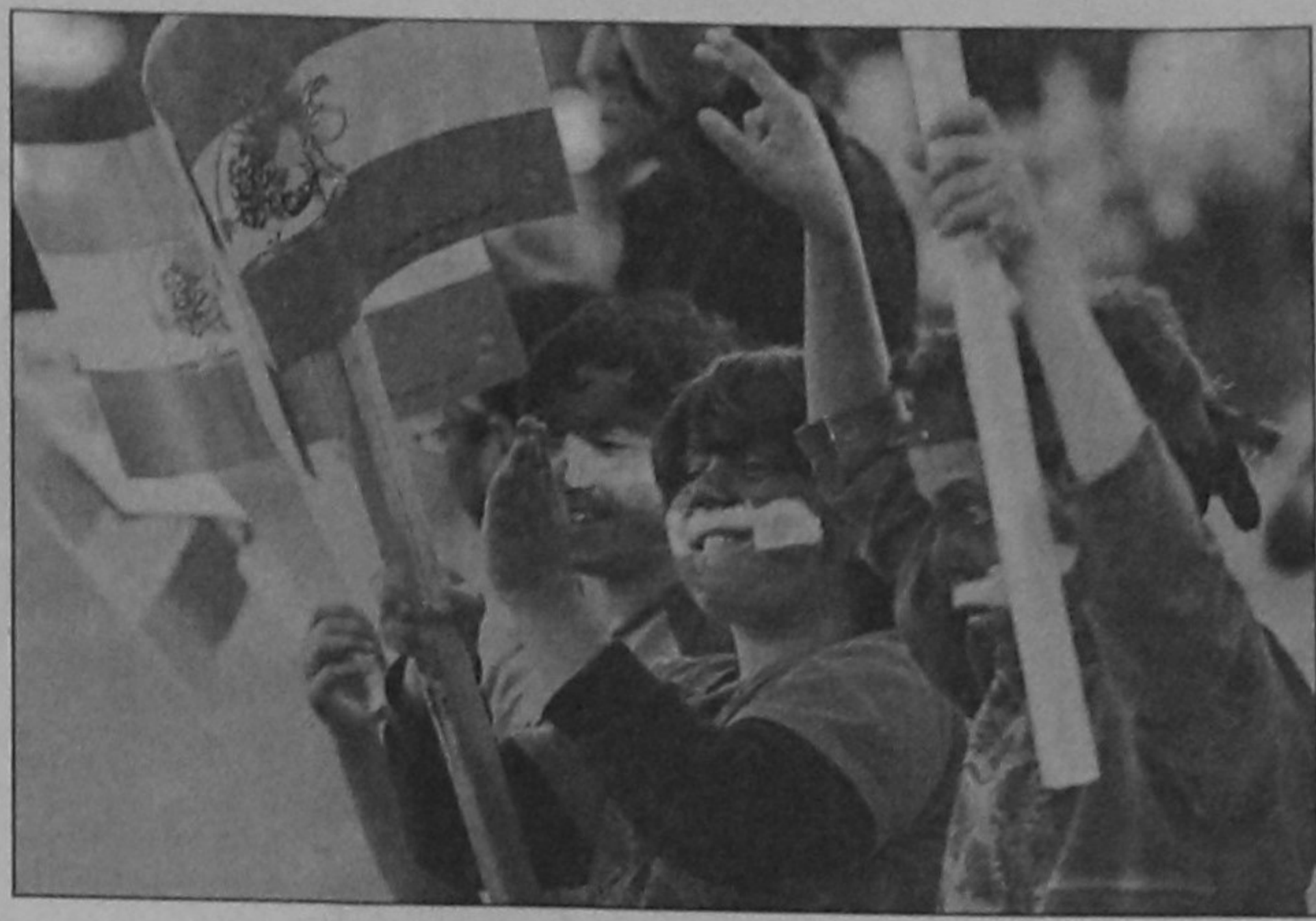
Iranian children demonstrate in front of passing motorists during a rally against the recent Iranian elections outside the Federal Building in Los Angeles on Monday.

France warned its tourists still in the country against taking pictures and said rallies should be avoided.