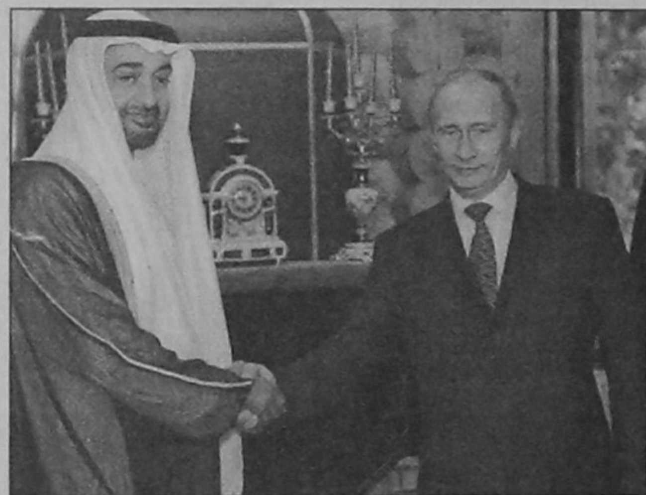
Russian Prime Minister Vladimir Putin (R) shakes hands with United Arab Emirates' Crown Prince Sheikh Mohamed Bin Zayed Al Nahyan (L) near Kaluga yesterday. The two politicians discussed issues of bilateral importance.

A Pentagon official, who spoke on condition of anonymity, told reporters in Washington over the weekend that "North Korea will factor in very strongly" in the talks.