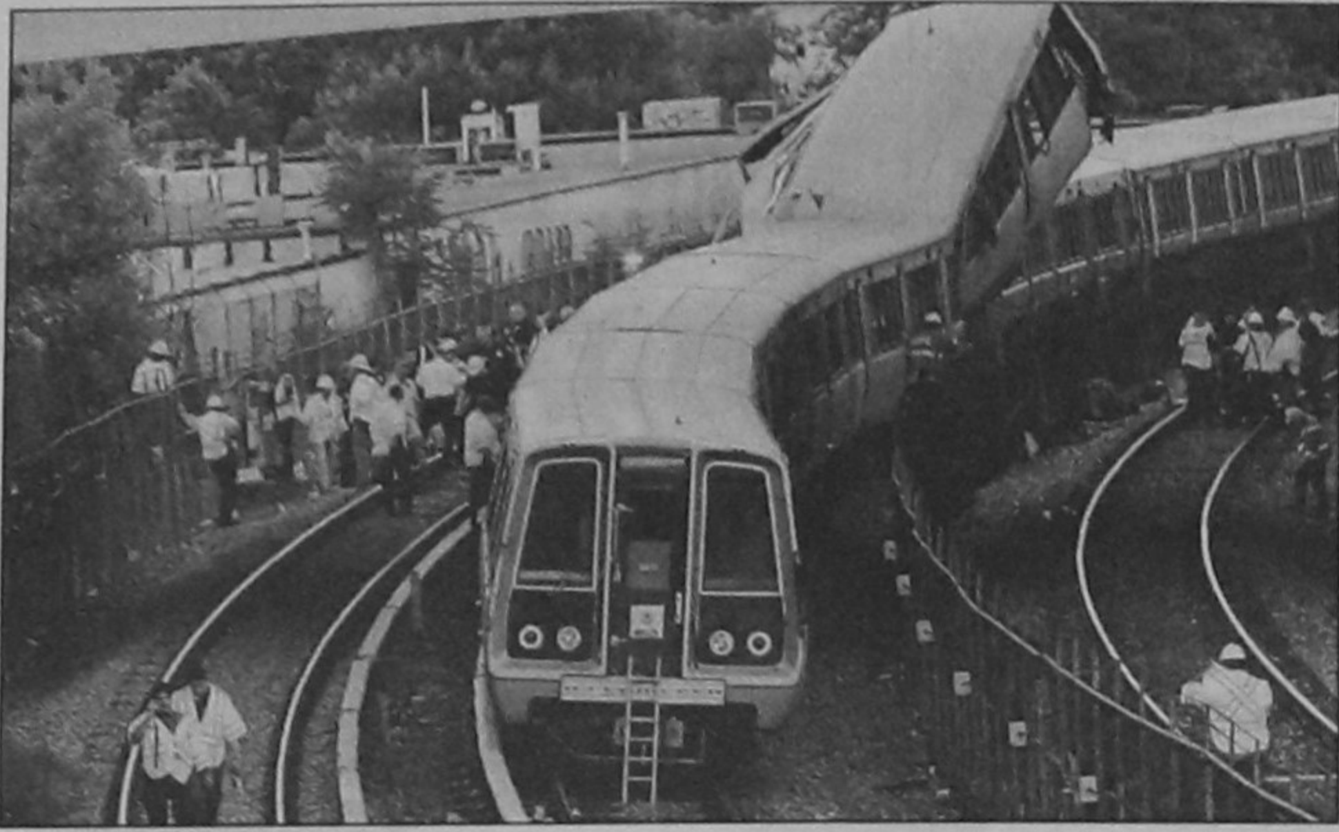
Emergency personnel investigate the scene of a Metro subway train collision in Washington, DC, on Monday. Nine people were killed and scores of others injured in the rush-hour collision between two Metro trains in the US capital.

We are withdrawing dependants until the situation improves," The Sun quoted a Foreign Office spokesman, as saying.