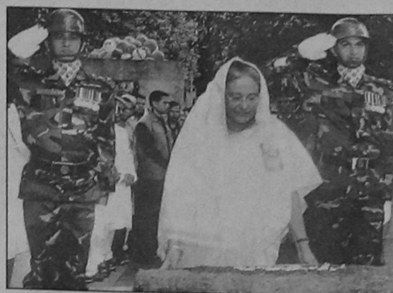
Prime Minister Sheikh Hasina places wreaths at the portrait of Bangabandhu Sheikh Mujibur Rahman at Bangabandhu Memorial Museum in the city yesterday on the occasion of the 60th founding anniversary of Awami League.

Several hundred trucks decorated with different party slogans, including charter for change and digital Bangladesh, carried party workers, creating huge traffic jam in most of the streets in the city much to the