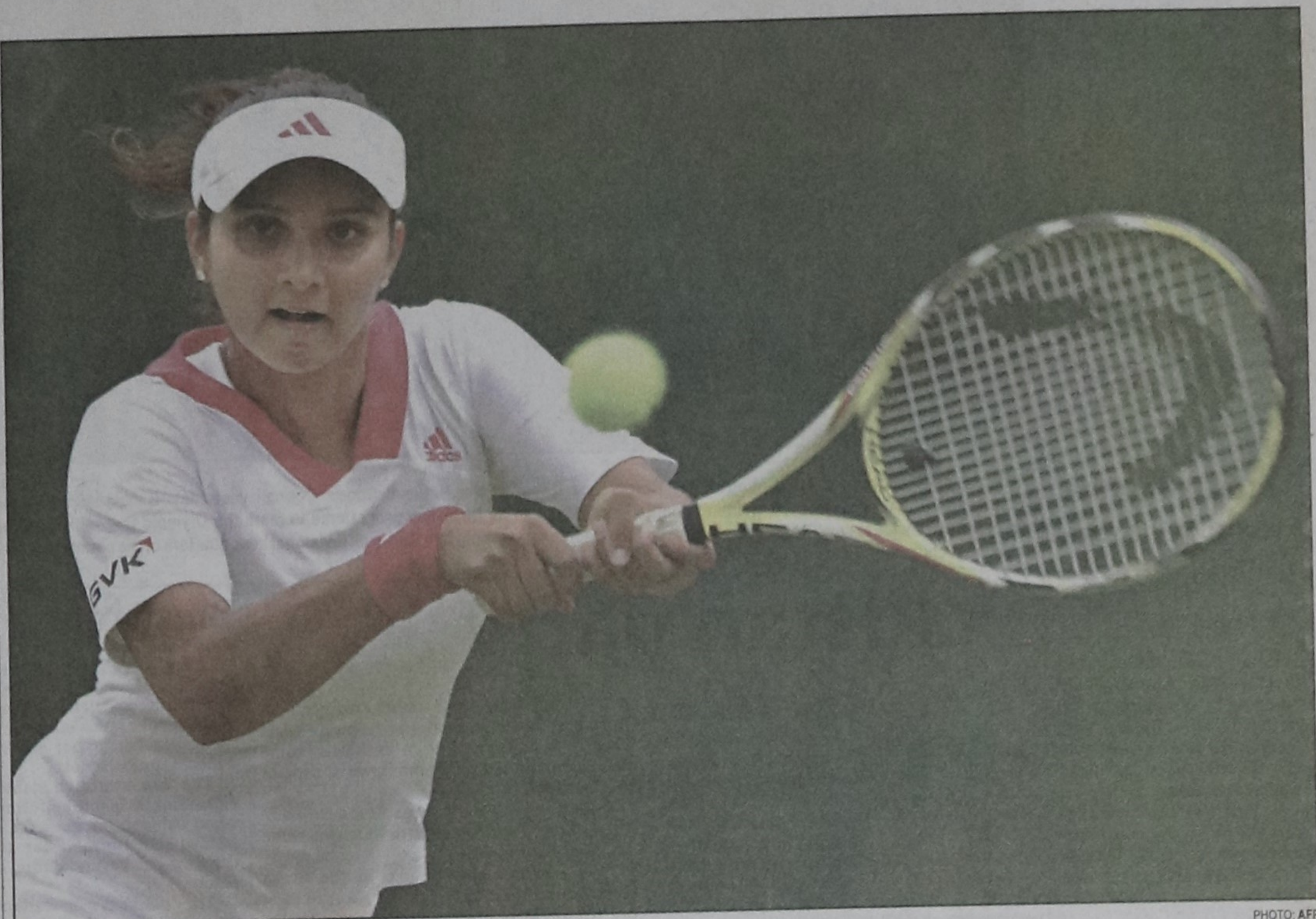
Indian tennis sensation Sania Mirza plays a backhand against Germany's Anna-Lena Groenefeld during their Wimbledon first round match at the All England Club in London yesterday.

The tour will end with the lone T20 match on August 2 at Warner Park, Basseterre, St Kitts.