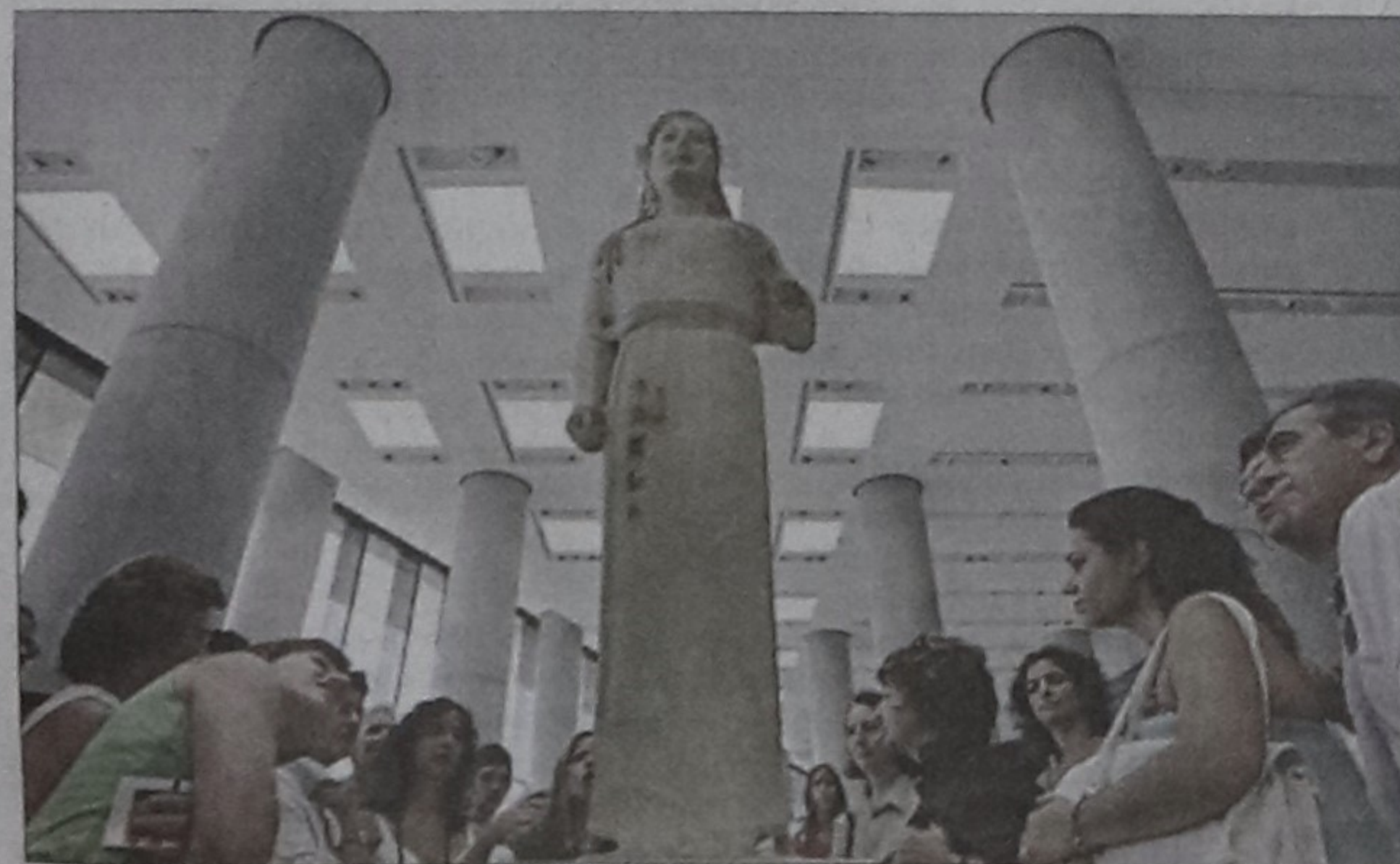
Visitors admire a sculpture at the new Acropolis museum in Athens on June 21, 2009.