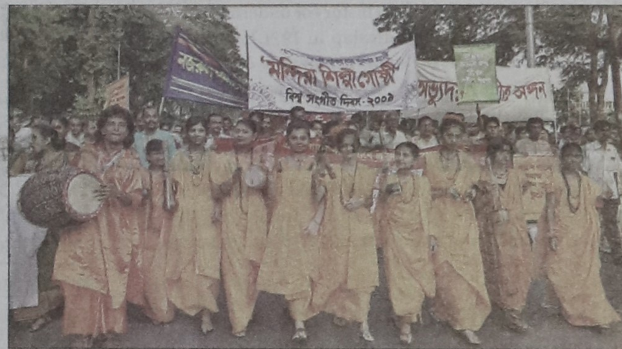
Youngsters in traditional 'Baul' attire lead the World Music Day rally.

The event concluded with a rally brought out from Shaheed Minar.