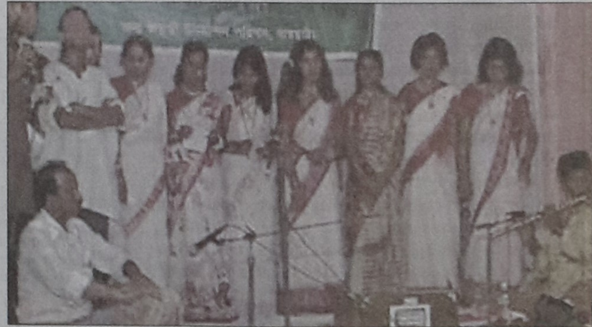
Local performers recite poetry at the celebration of poet Nirmalendu Guun's 65th birthday.

The speakers discussed Nirmalendu Guun's contribution to contemporary Bangla poetry and journalism. Later, local artistes performed at a lively cultural programme.