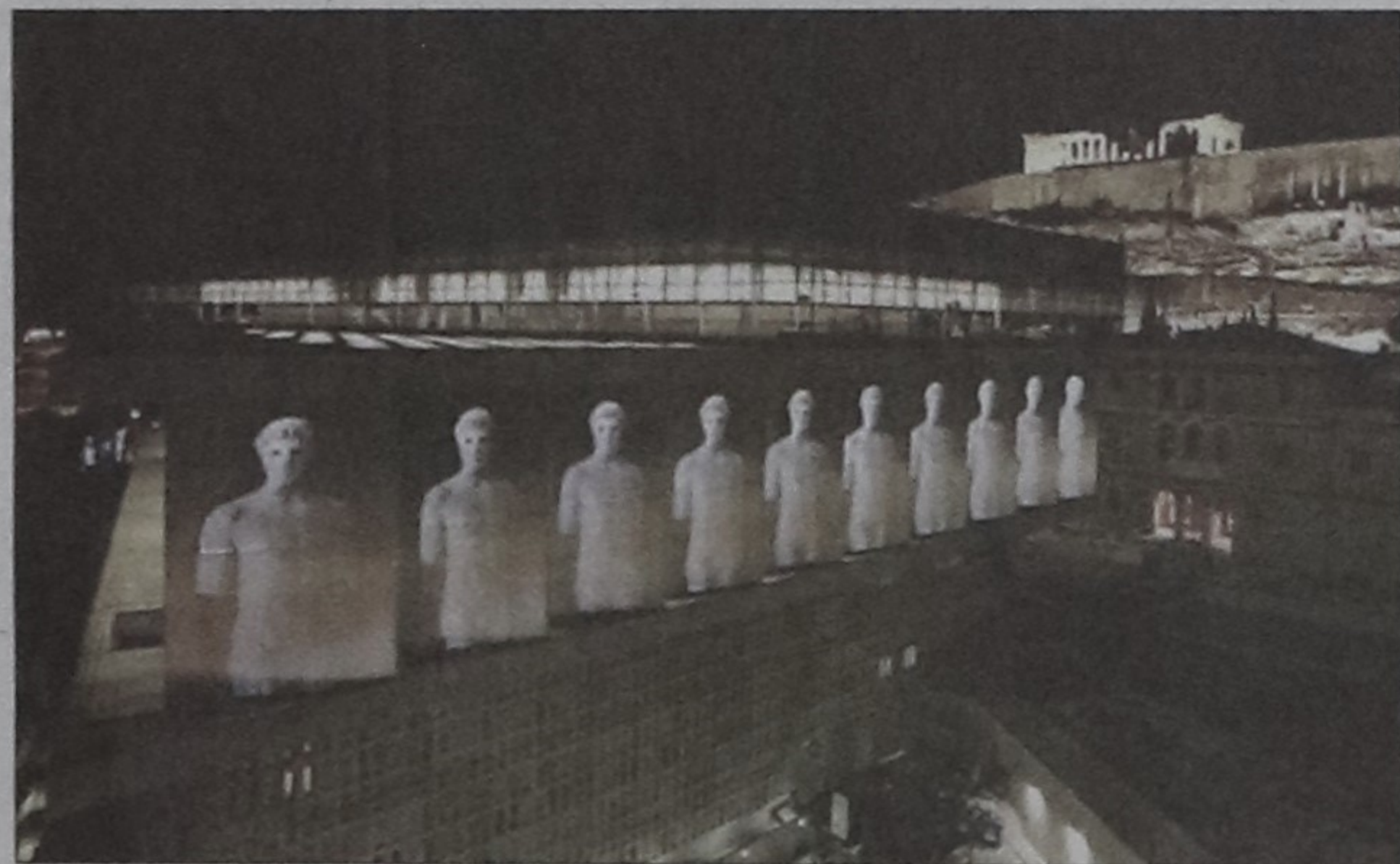
Photos of the so-called Kritios Boy statue are projected onto the walls of the new Acropolis Museum in Athens, Greece. The ancient Parthenon temple is seen in the background.