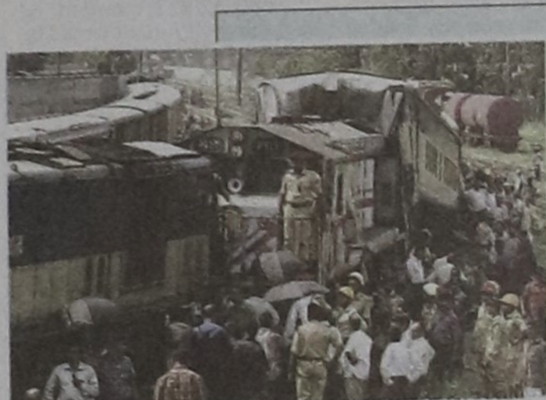
Two express trains collided head-on outside Kamalapur Railway Station yesterday leaving a man dead and six others injured. Picture inset shows police and a rescue team inspecting the damaged bogies of the train.