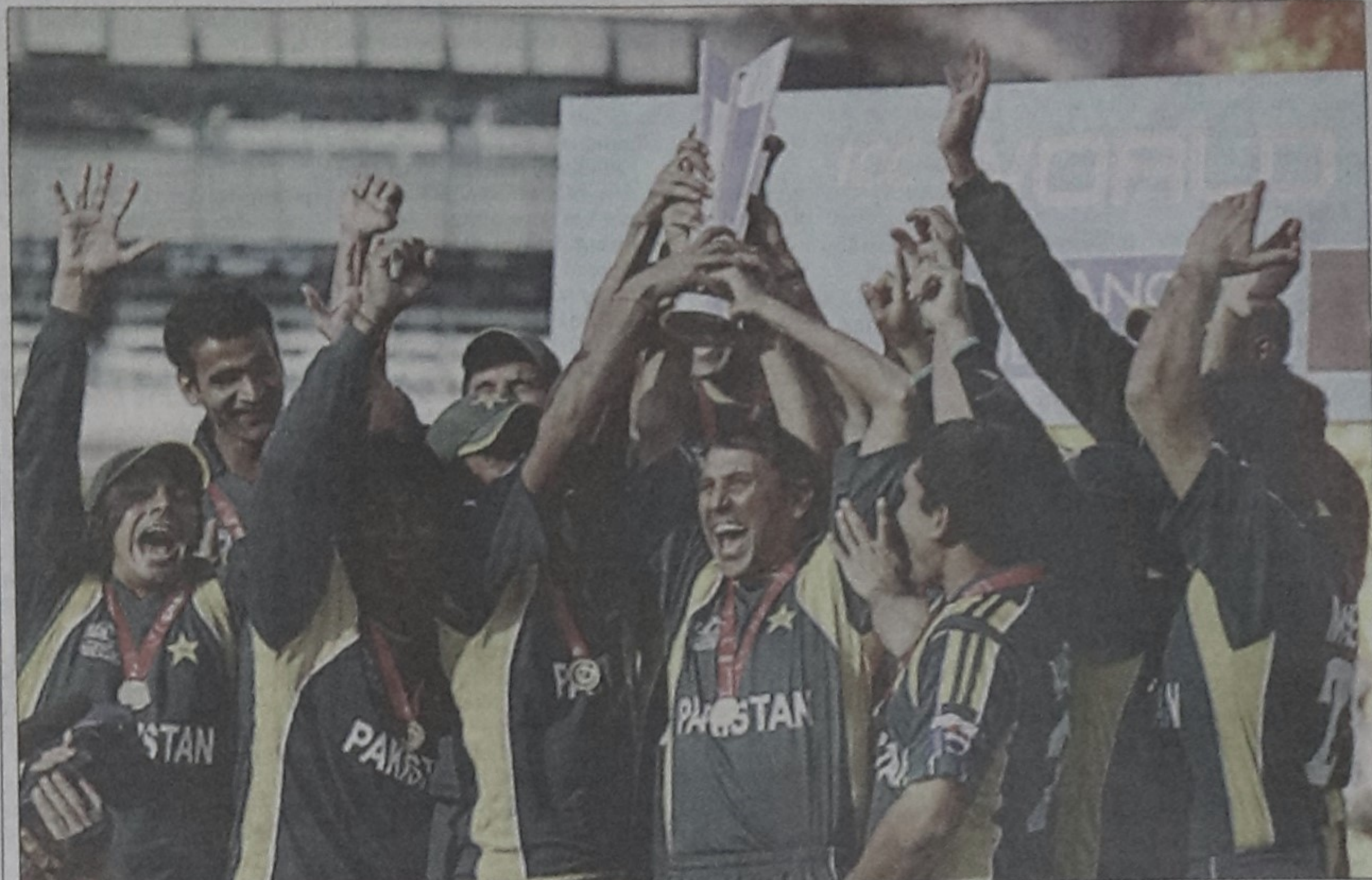
CLASS OF 2009: Pakistan captain Younus Khan (C) and his teammates celebrate with the ICC World Twenty20 trophy at Lord's yesterday after beating Sri Lanka in the final by eight wickets.