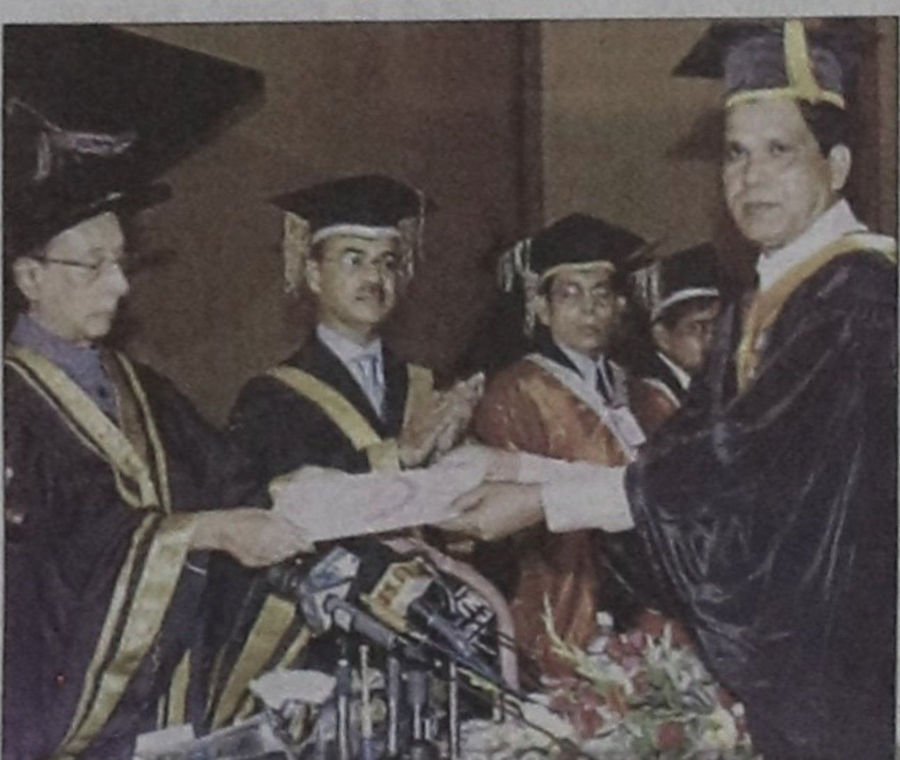
President Zillur Rahman gives away a certificate to a successful graduate at the ICMAB Convocation 2009 at Hotel Sonargaon in the city yesterday.