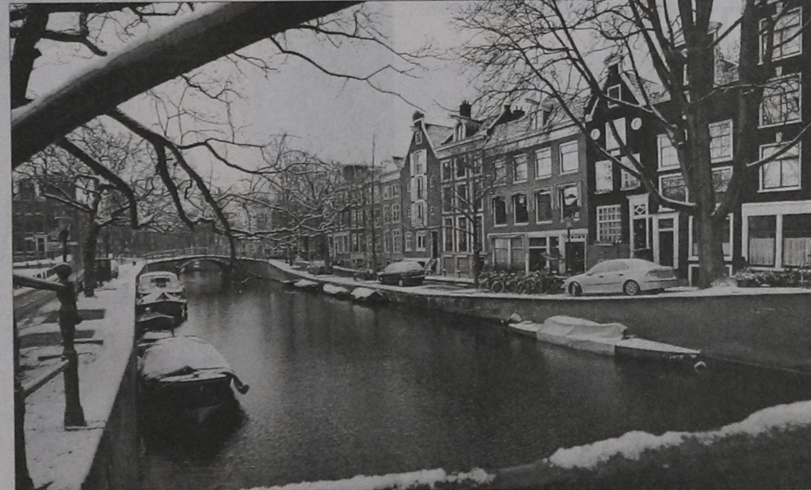
This photo taken on December 30, 2005 shows a view of snowed canals in the centre of Amsterdam.

Their new home has majestic wooden staircases, decorative mouldings and marble walls. But the carpets in the bedrooms are torn, some windows