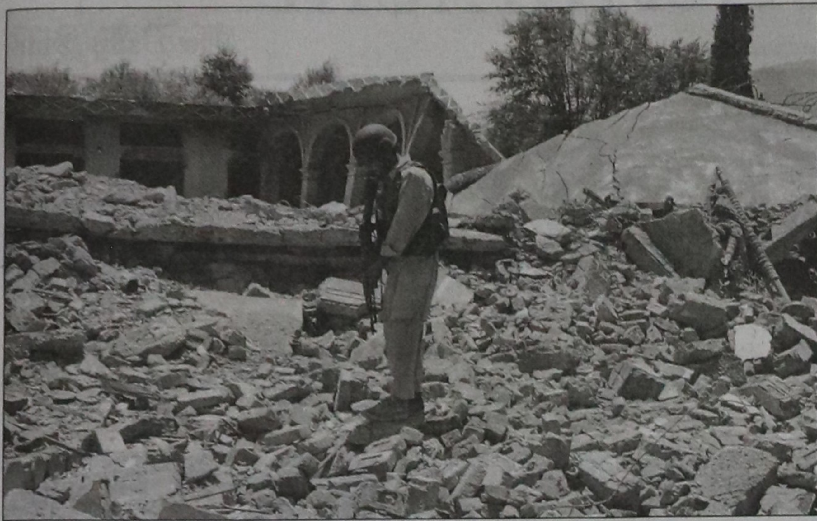
A Pakistani security officer stands on the rubble of houses destroyed during a military operation against Taliban militants in Sultanwas village in Buner district on Friday. Pakistani security forces launched an offensive to dislodge Taliban guerrillas from three northwest districts around Swat valley in late April, after militants flouted a peace deal and thrust towards the capital Islamabad.