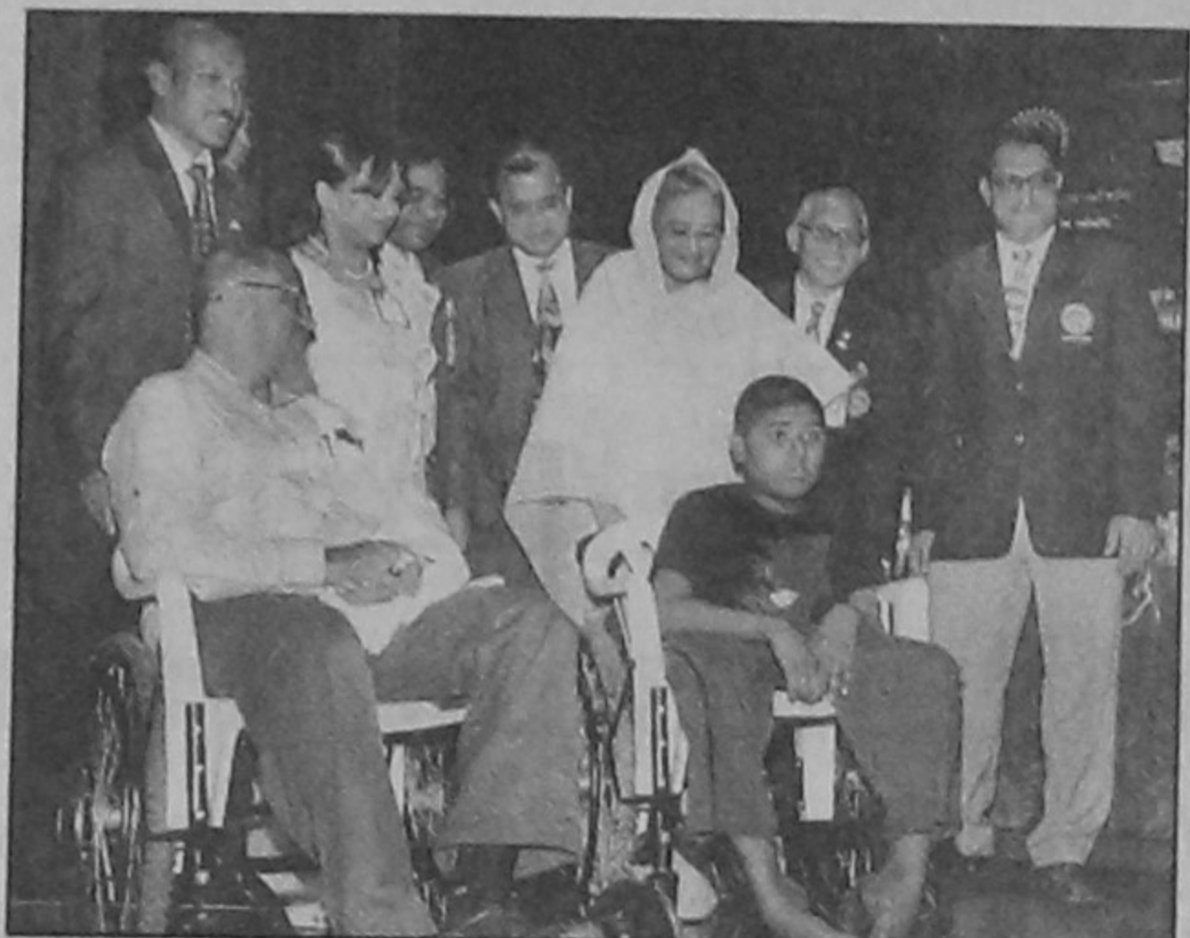
Prime Minister Sheikh Hasina distributes wheelchairs among the war-wounded freedom fighters and physically challenged people at Osmani Memorial Auditorium in the city yesterday.

A total of 550 physically challenged people, including women and children, were given