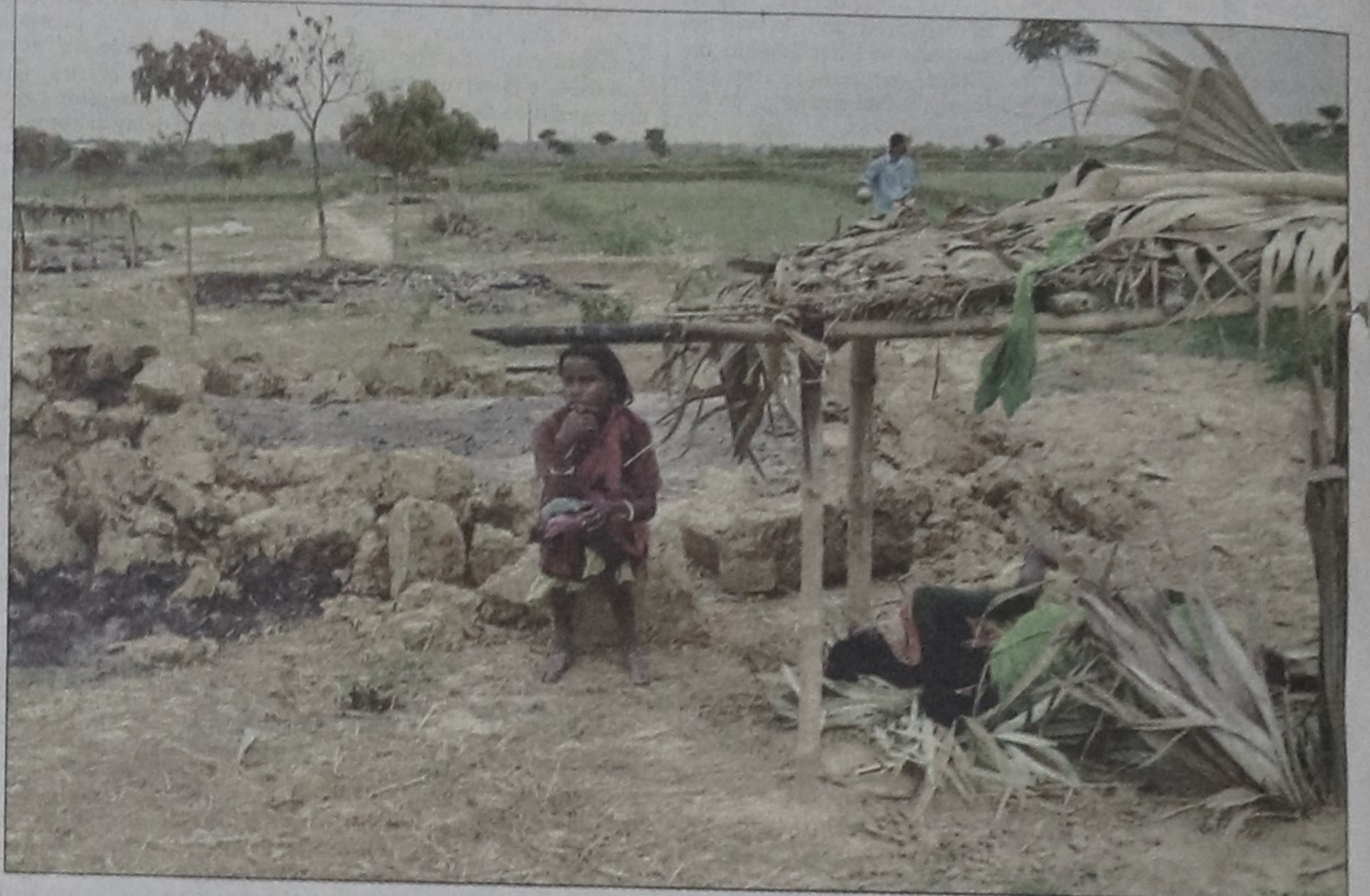
An indigenous woman sits on the rubble of her home, which land grabbers torched on June 13. The palm-leave shed on the right is her home now.