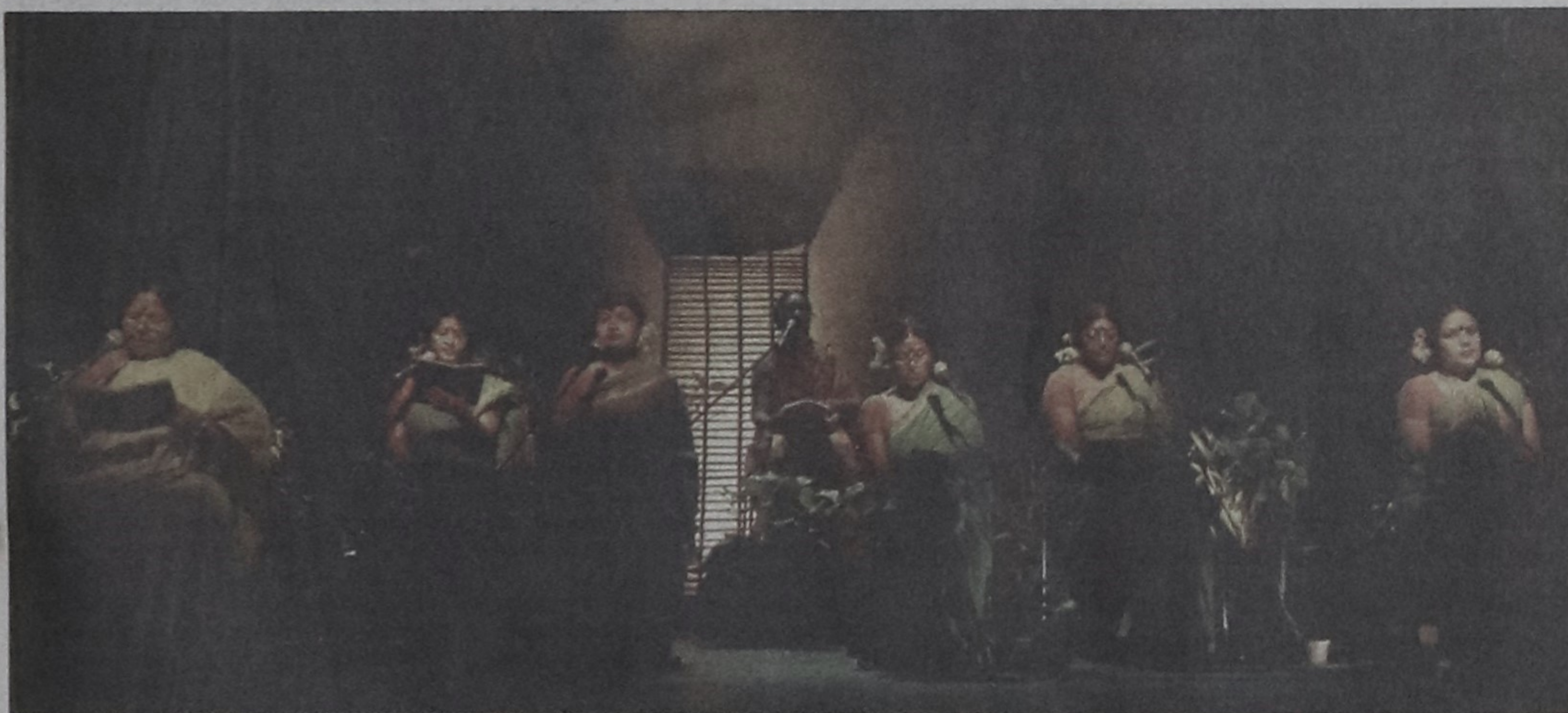
Reciters of Yukta narrate tales of spirited women at the programme "Katha Manobi."