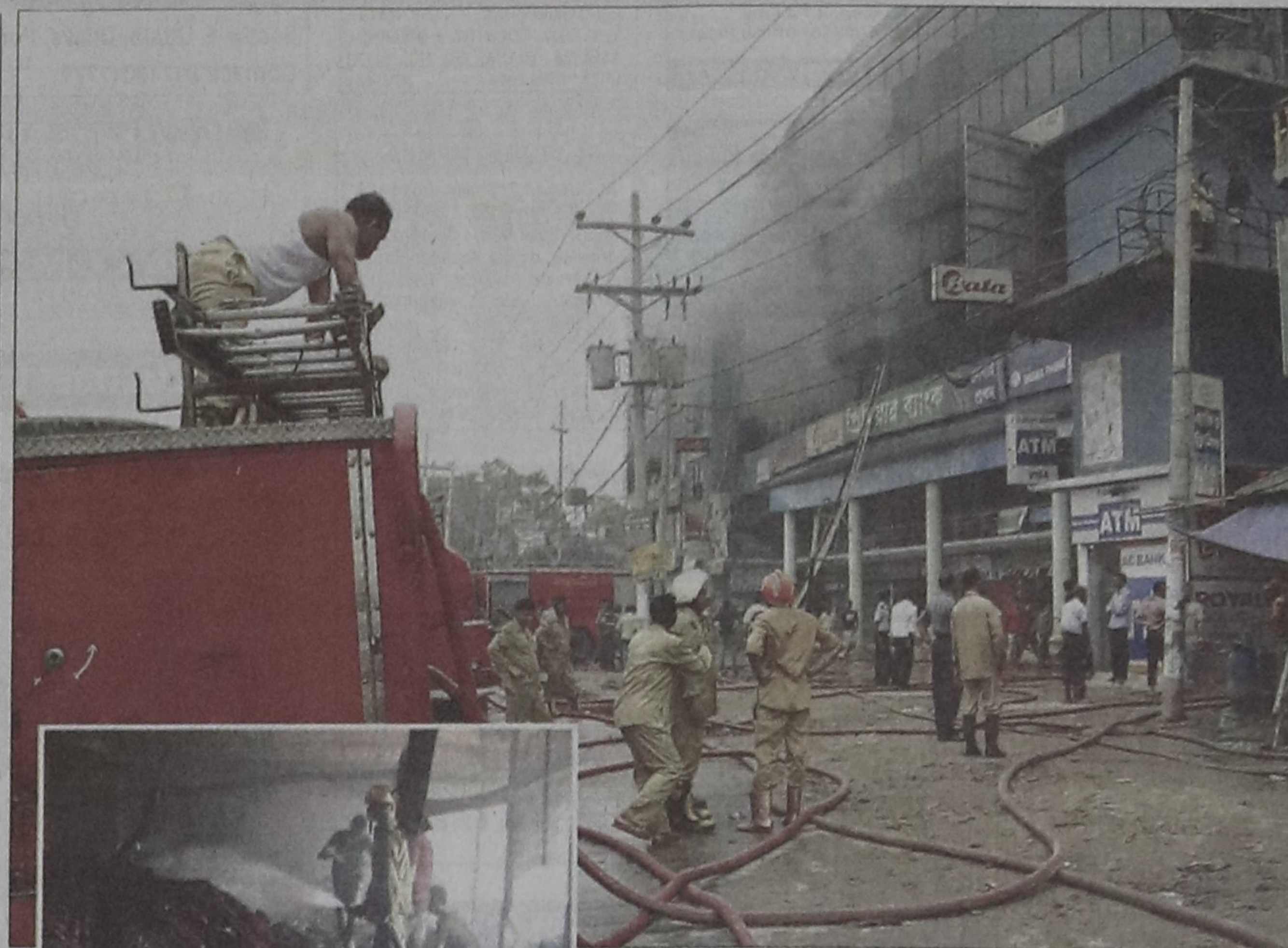
Plumes of smoke rise as a fire broke out at Intraco Sweaters Ltd factory at Gonokbari in Savar yesterday. (Inset) Firefighters spray water to extinguish the blaze. (Story on Page 1)