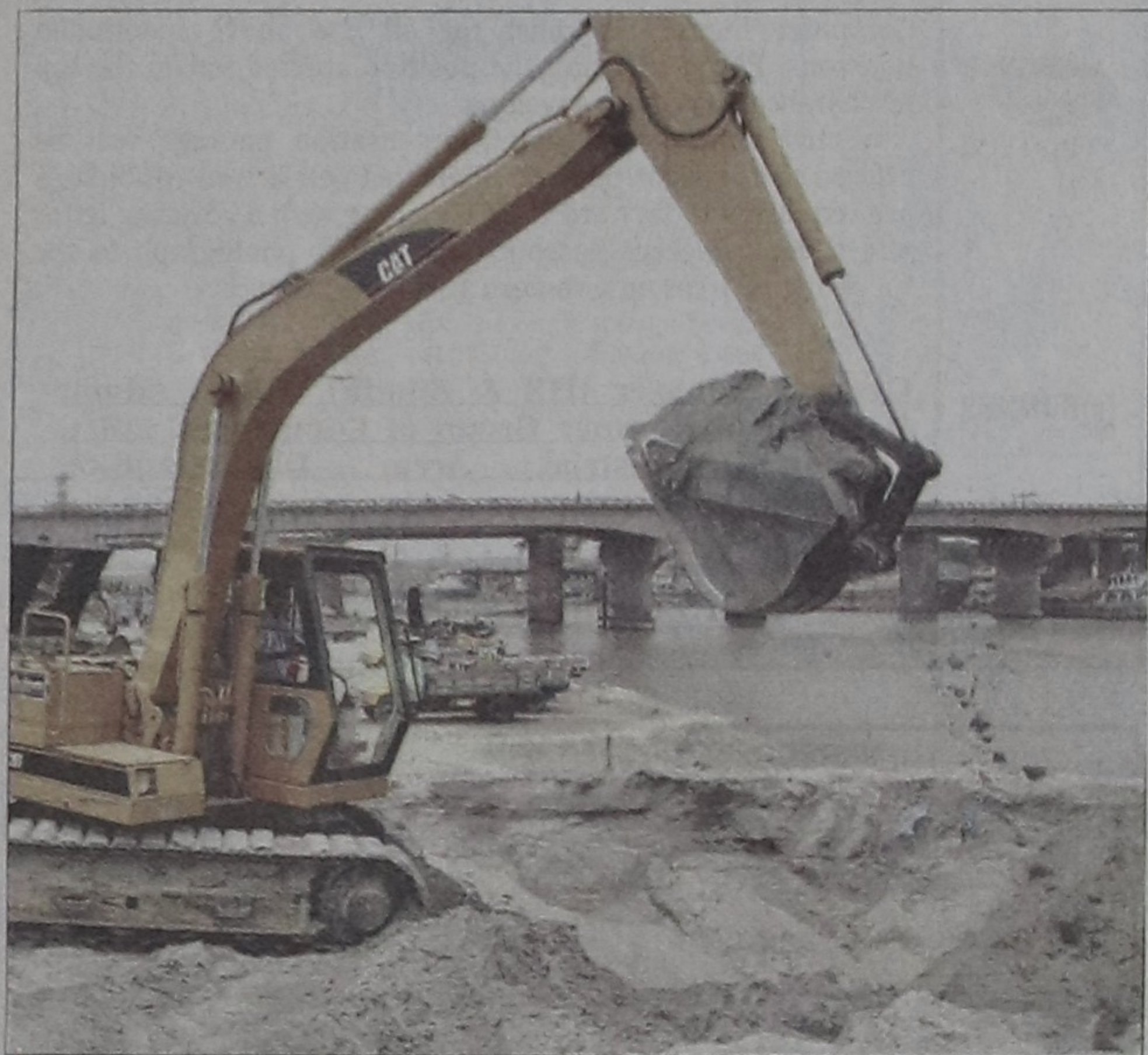
An excavator of Bangladesh Inland Water Transport Authority (BIWTA) removes a huge pile of sand from the river Turag at Aminbazar yesterday as its drive against illegal establishments continues. (Story on Page 16)

To mark the day, Neeti Gobeshona Kendra, a non-government research centre, will organise a discussion today at its Panthapath office in the city.