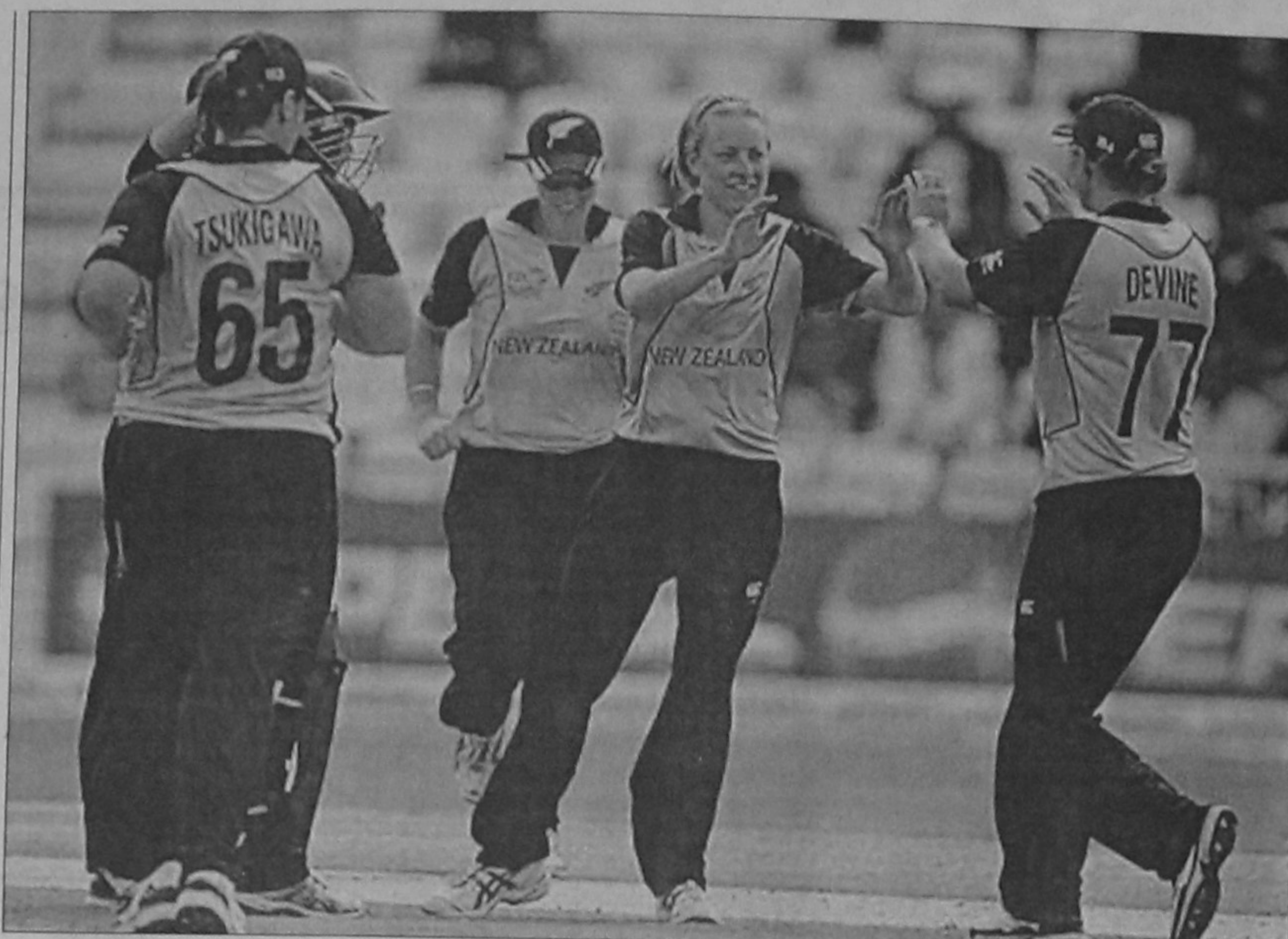
New Zealand bowler Sian Ruck (C) celebrates with teammates after taking an India wicket during their ICC Women's World Twenty20 first semifinal in Trent Bridge yesterday.

The team will leave for Cox's Bazar on Saturday.