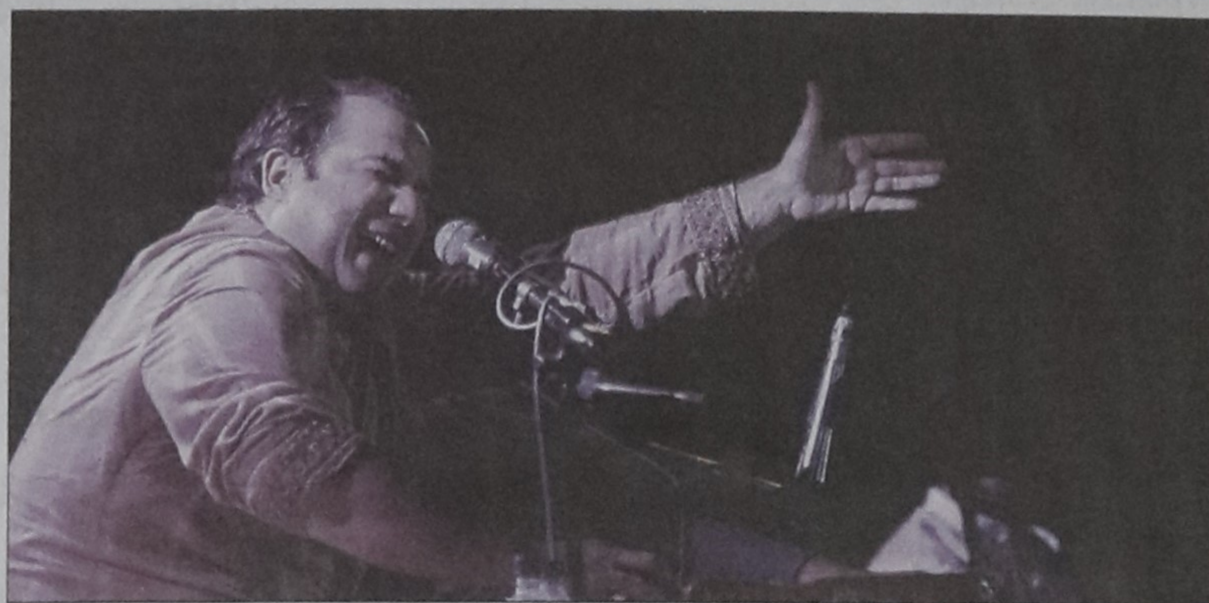
Immersed in passion.

Why is Rahat regarded as one of the best performers at this young age, especially in Qawwali? Bollywood